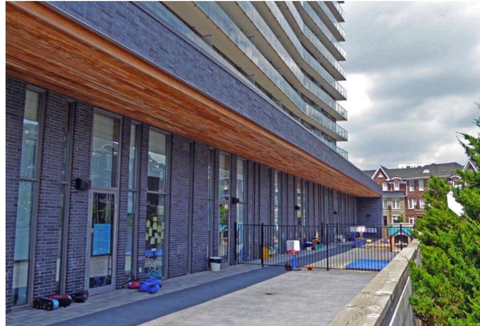
A B C The child care's outdoor play space is adjacent to the indoor play space. The large overhanging canopy provides shade and spatially defines the daycare element that lines the east side of the building.