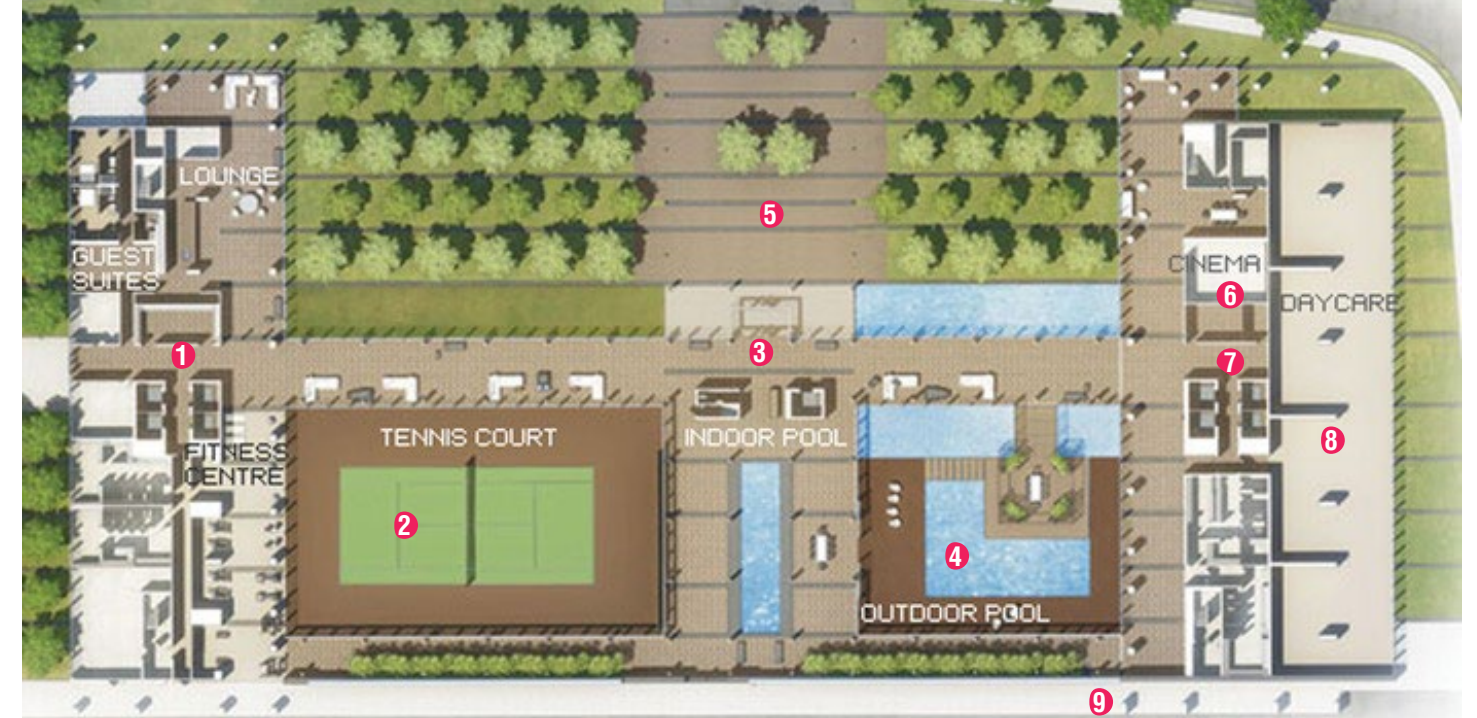
A B C The site plan is anchored by both towers, which surround the amenity complex and the POPS in the forcourt. The child care space is organized into a bar along the east of the tower's base building. 1) west tower 2) tennis court 3) glass link 4) pool 5) POPS forcourt 6) theatre 7) east tower 8) child care 9) outdoor bicycle parking

The Windermere Early Learning Centre was secured through a Section 37 agreement. It is a non-profit, licensed child care that has the capacity for 52 children aged from 0 to 4 years. Roughly 50% of the children in the child care live in this development and are given enrollment priority. The child care has access to the building's amenities. Currently the child care uses the theatre and the tennis courts during the daytime, off peak hours. Care-givers have access to visitor parking below grade for convenient pick-up and drop-off.