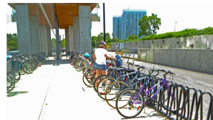
A B C Ample visitor bike parking is adjacent to the child care entrance which enables convenient pick-up / drop-off.