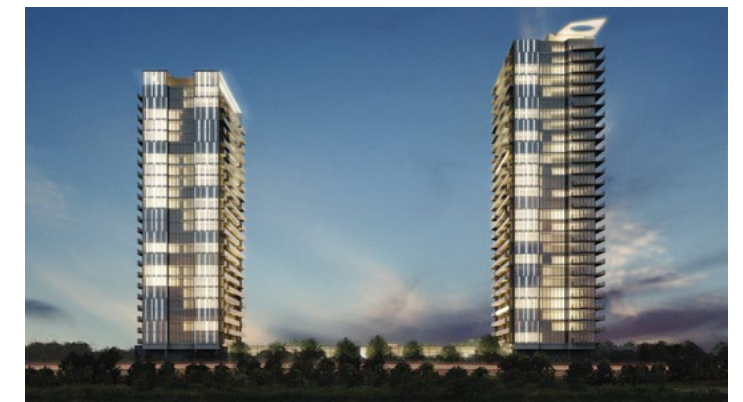
Tower development as seen from Lake Ontario.