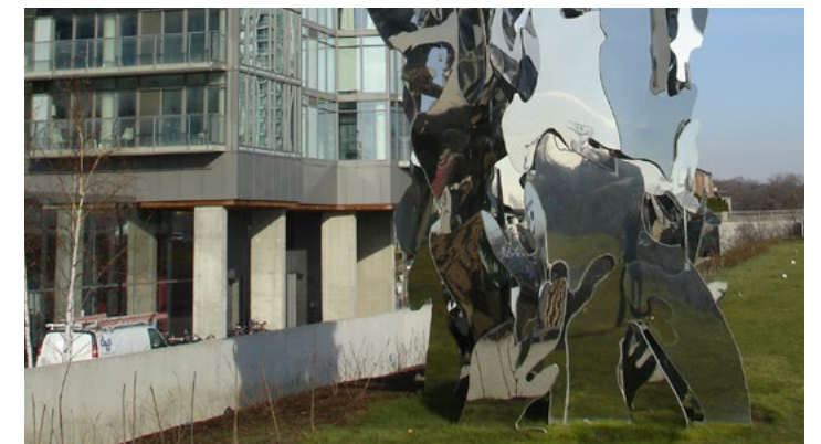
The public artwork entitled Echo, by Jim Hodges, is a playful element within the development which children can relate to, contributing to a sense of place.