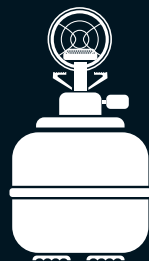
Portable Fuel Heater