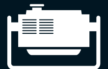
Portable Fuel Fired Generator