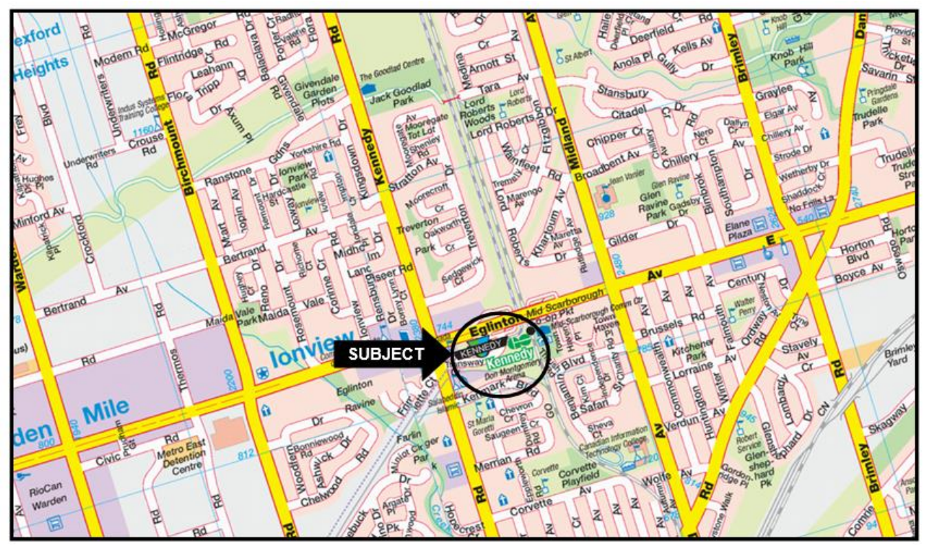
DAF No. 2015-257