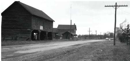
Keele & Finch in 1955

After 1955 came immigration and growth, widened roads, York University and other new agents for change.