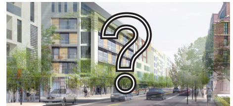
Keele & Finch in 2045?

What happens after the subway and light rail transit? How should the area grow?