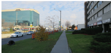
Keele & Finch in 2015

After 2015 came subway construction and funding for a new light rail transit (LRT) line to Humber College.