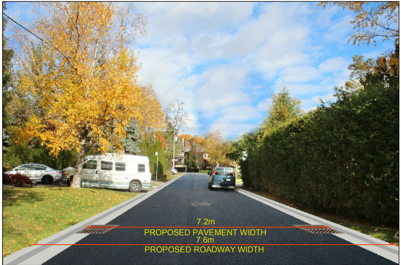
FIGURE LE1 ILLUSTRATION OF EXISTING AND PROPOSED ROAD DIMENSIONS - LEWES CRES