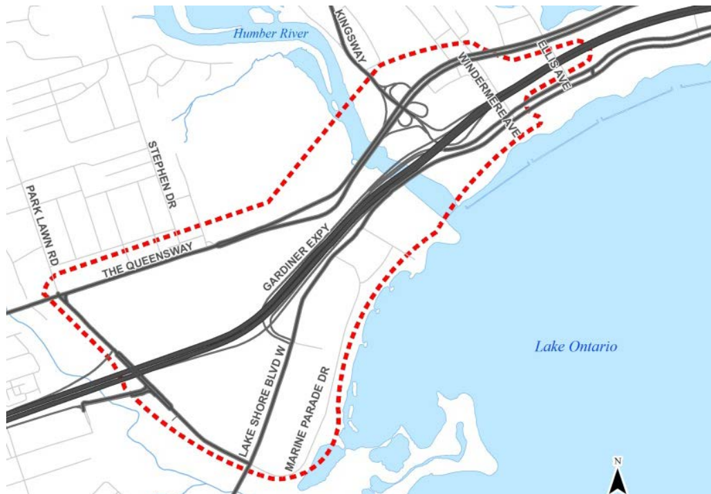
Map of Study Area