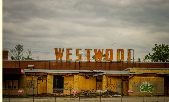
The former Westwood Theatre, demolished in 2013