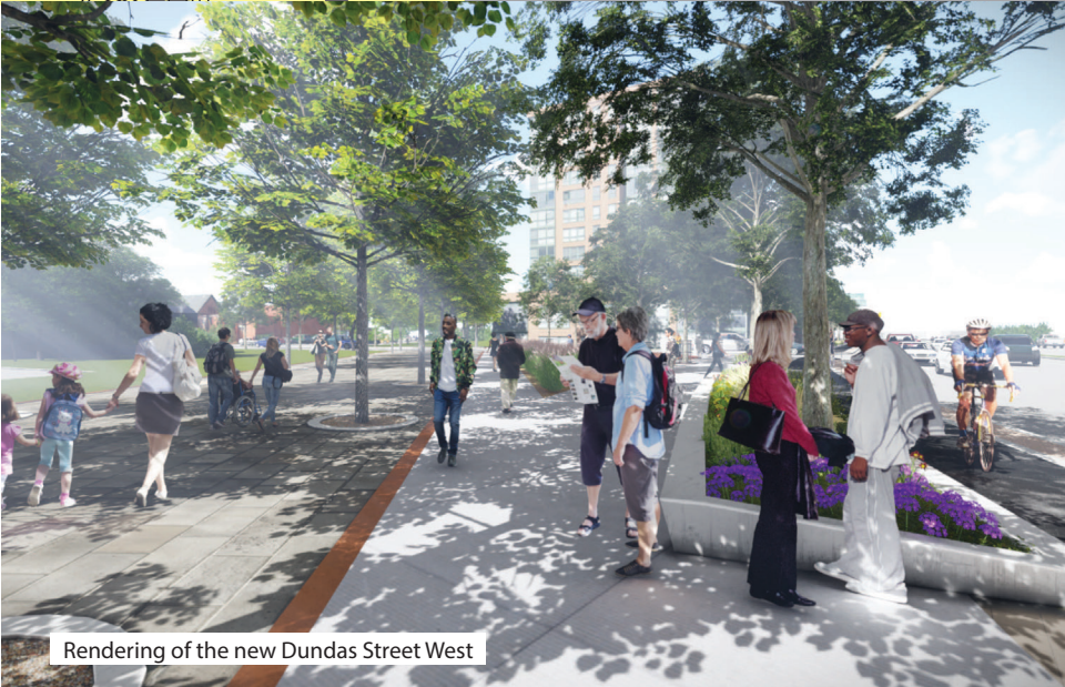
Rendering of the new Dundas Street West