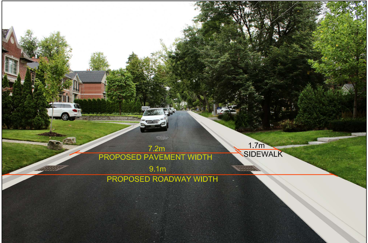
FIGURE SL1 ILLUSTRATION OF EXISTING AND PROPOSED ROAD DIMENSIONS - ST LEONARDS AVE