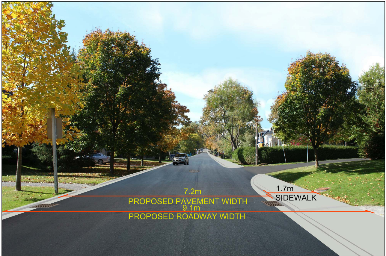
FIGURE SL3 ILLUSTRATION OF EXISTING AND PROPOSED ROAD DIMENSIONS - ST LEONARDS AVE