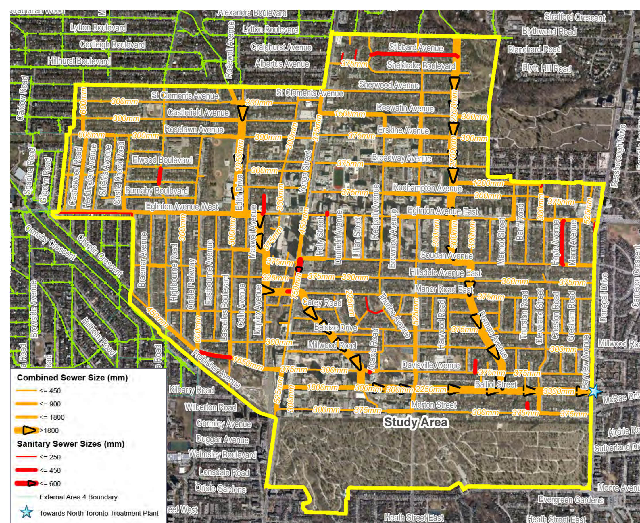
Sanitary Sewer System