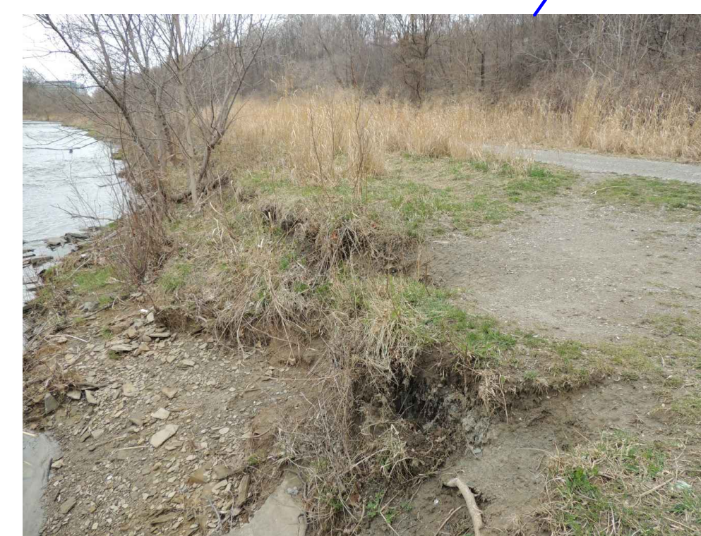
SCOUR SITE 3