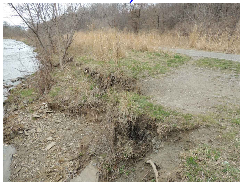
SCOUR SITE 3