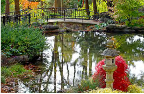
High Park Hillside Gardens