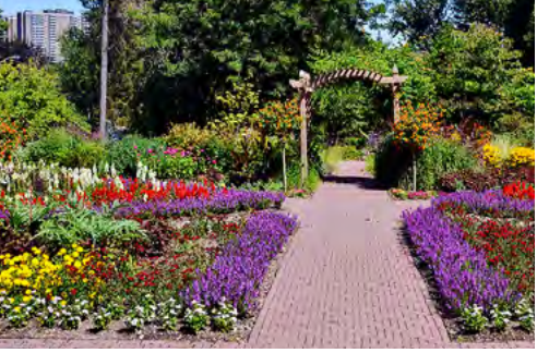
James Gardens