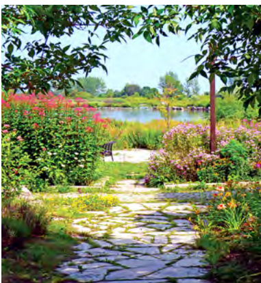
Humber Bay Butterfly Habitat