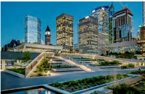
Nathan Phillips Square