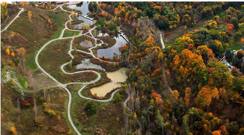
Don Valley Brick Works Park