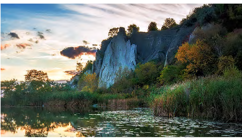
Bluffer’s Park