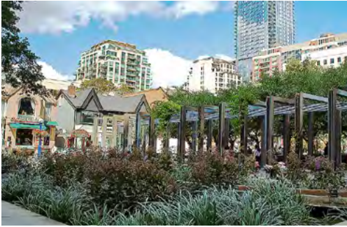
Village of Yorkville Park