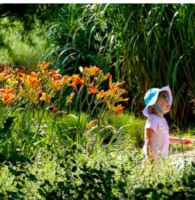
The Franklin Children’s Garden