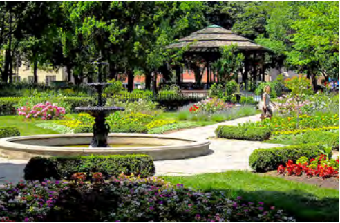
St. James Park