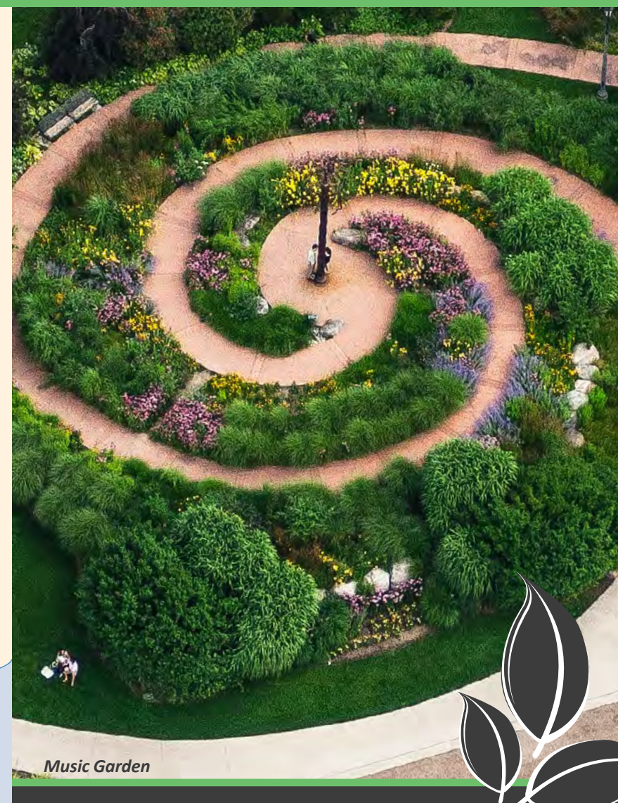
Music Garden toronto.ca/gardens Call 311