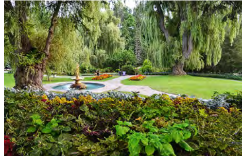
Edwards Gardens