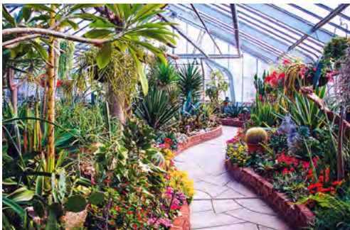
Centennial Park Conservatory