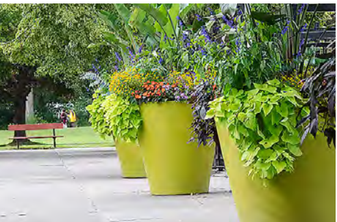
Toronto Island Park