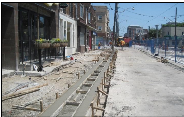
Sidewalk before concrete is poured.

The contractor will begin by breaking concrete and removing the old sidewalk. Next, the outside building wall at below ground level will be waterproofed. Concrete will then be poured for the new sidewalk.