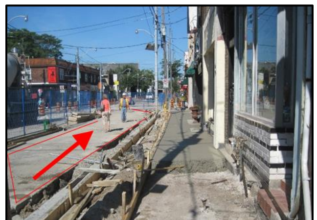
Pedestrian walkway and pedestrian safety fencing at 1.8 metres high, separating the construction zone.

Yes, pedestrians will be able to walk along Queen Street West during construction. The contractor will install pedestrian safety fencing that will be six-feet tall, separating the construction zone from the pedestrian walkway.