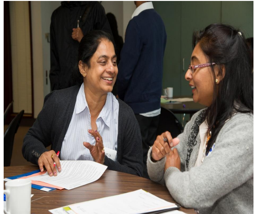
Two women sitting at a table with paper and pens, talking and smiling

If you answered “Yes!” review the Community Projects grant criteria and apply for one- time funding.