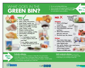
Greener Bin Guide