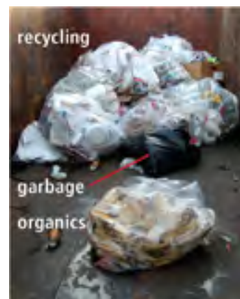
Garbage and organics contaminate recycle roll-off