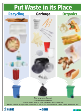
Put Waste in its Place