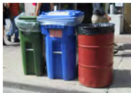
Waste station: clear bags for organics and recycling; black bags for garbage

NO. Use only clear plastic bags to line the recycling and organic toters.