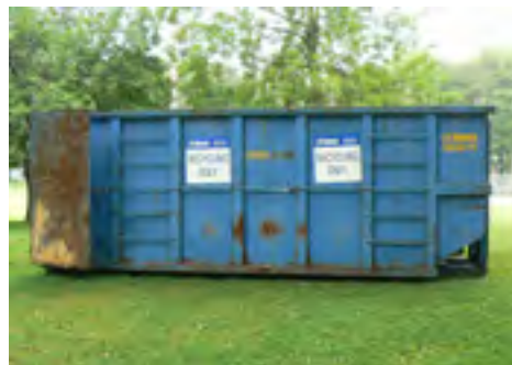
Recycle roll-off bin