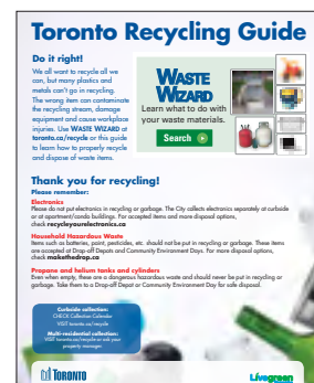
Toronto Recycling Guide