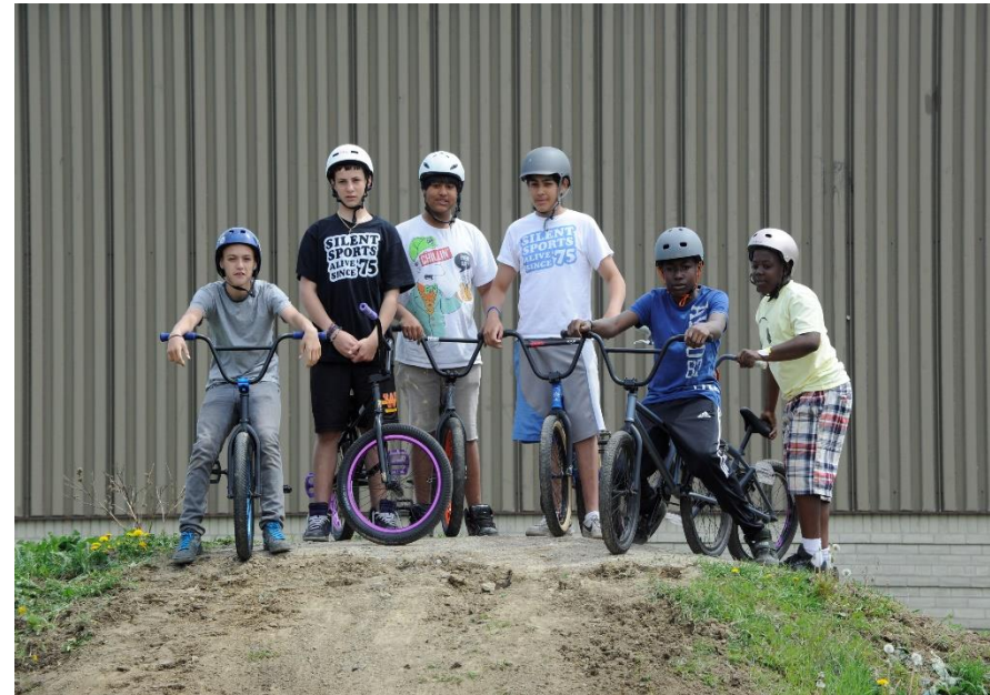
Group of male youth on top of a small hill, standing with their bikes

If you answered “Yes!” review the Community Events grant criteria and apply for one-time funding.