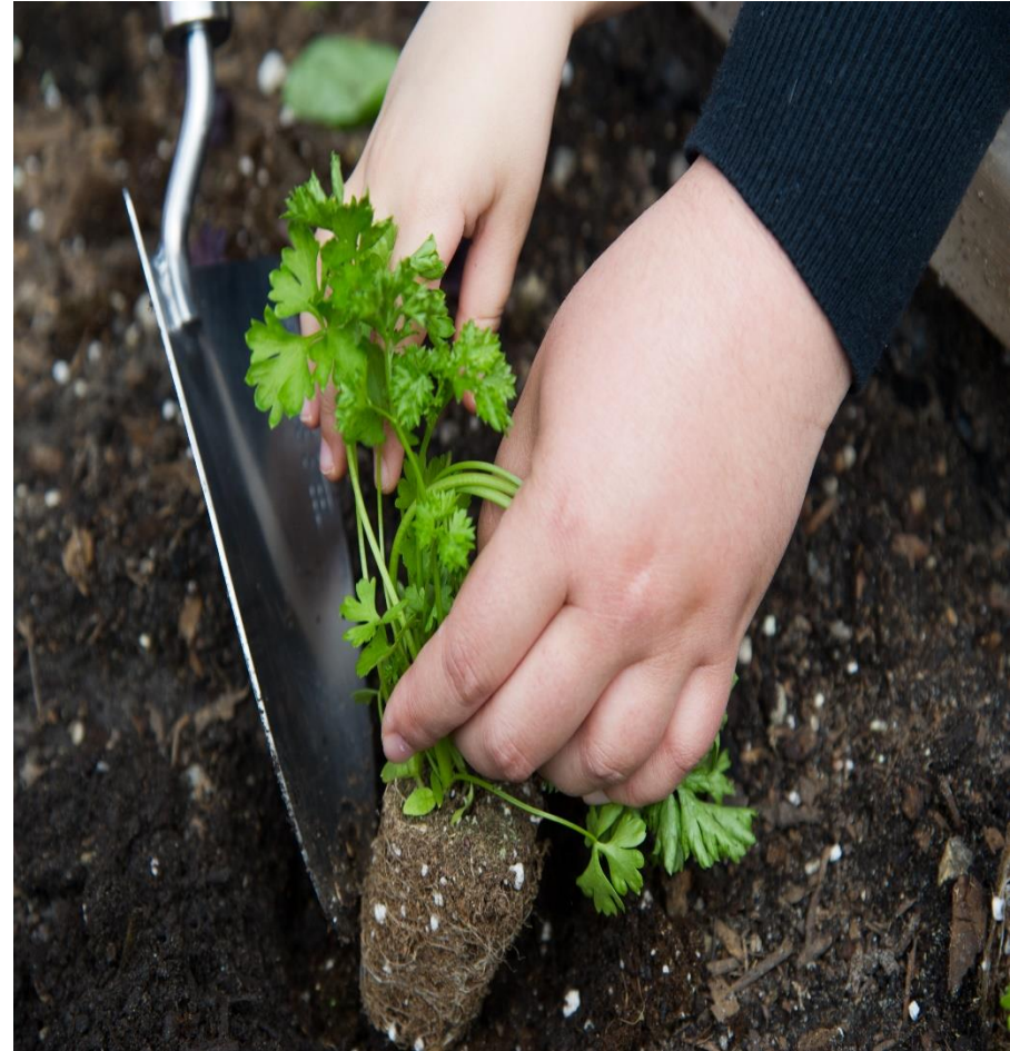
Two hands planting parsley in a garden