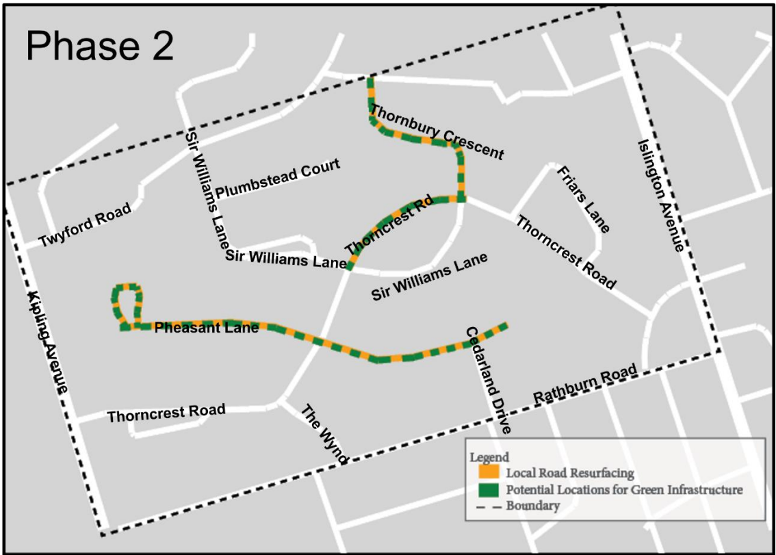
Maps of Local Road Resurfacing