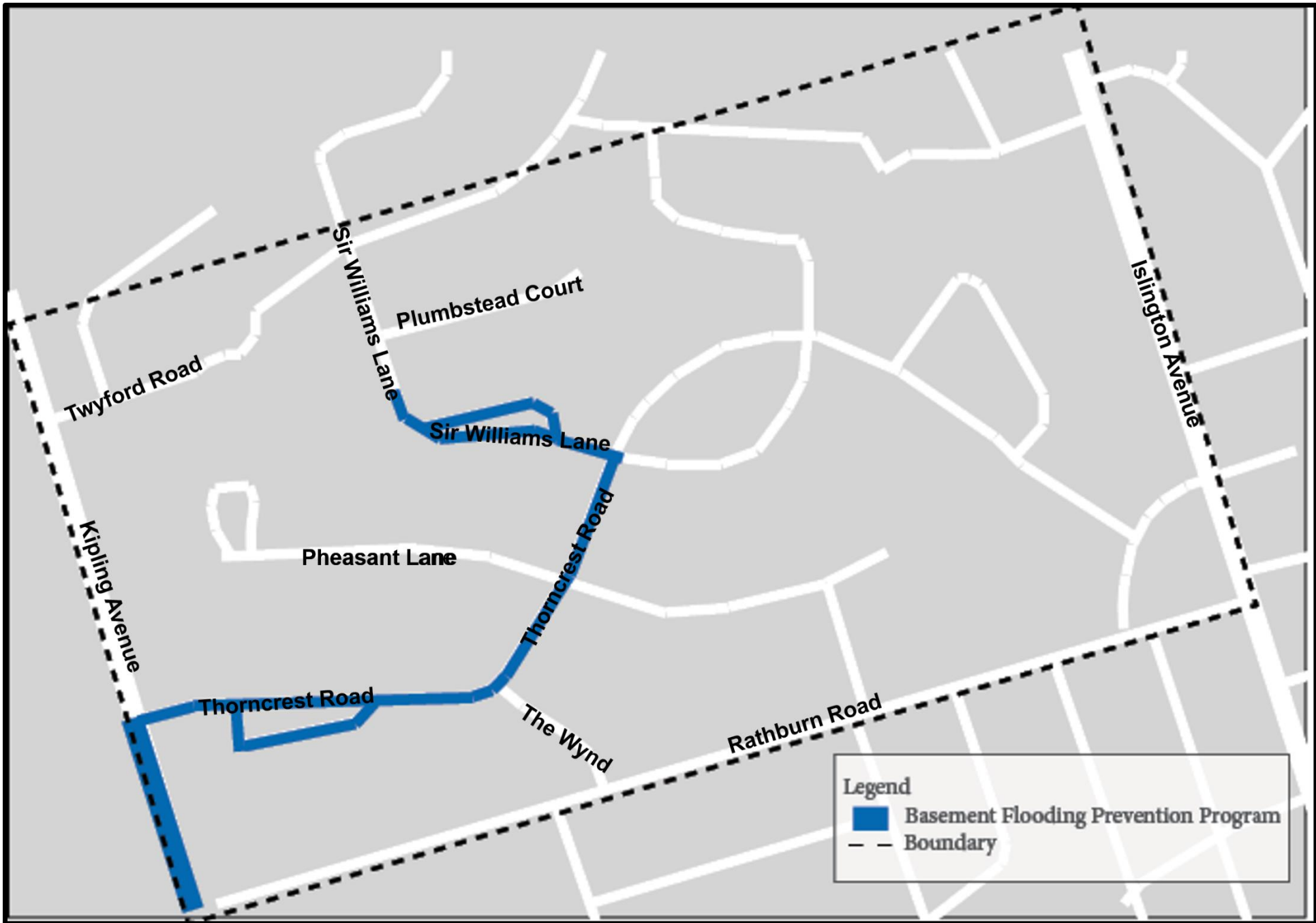
Map of BFPP Work Area