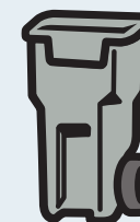
Large = 3 bags