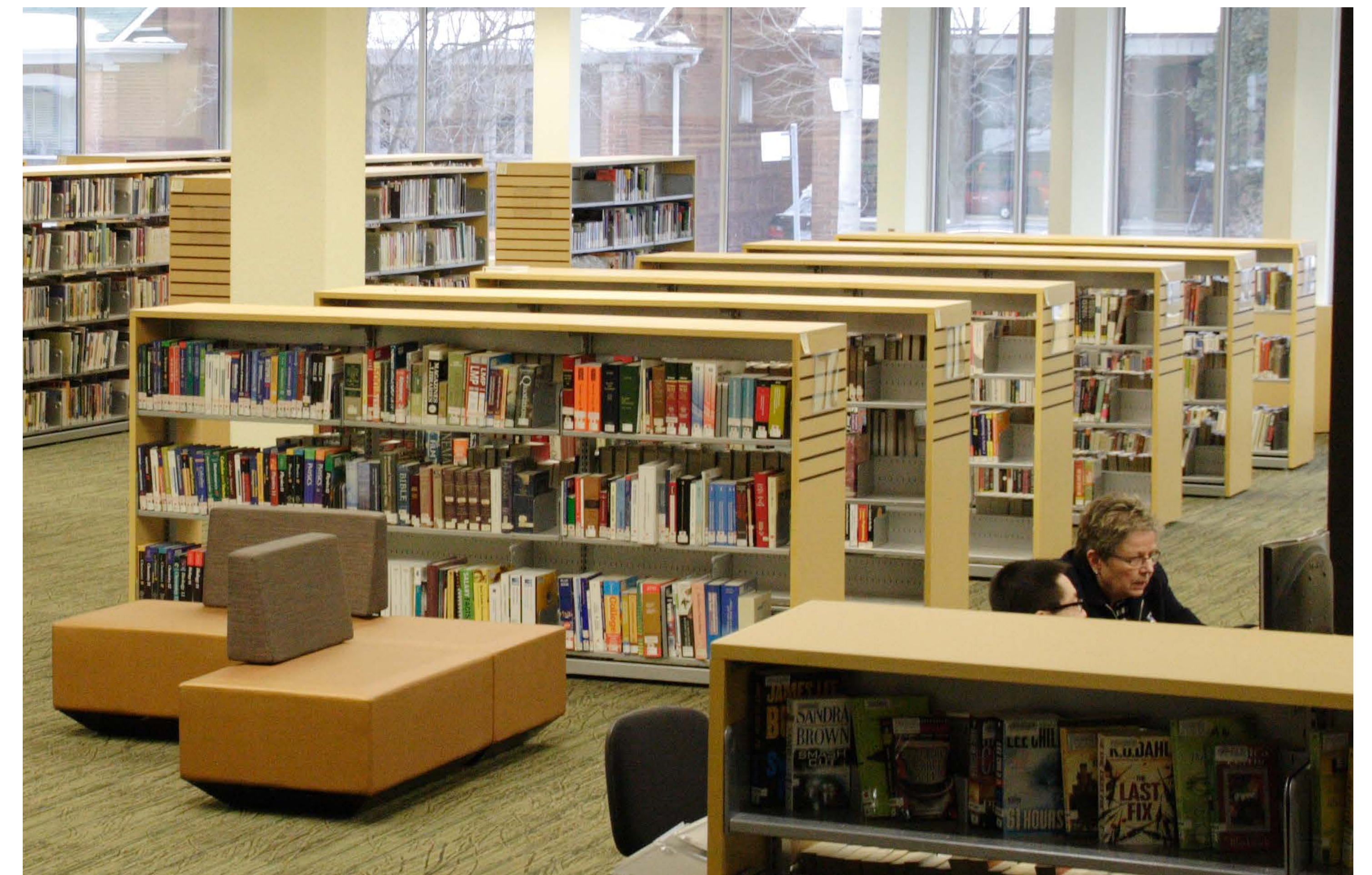
Northern District Library

The City's Official Plan recognizes that community services and facilities form part of a whole system of government and community resources, programs, facilities and social networks that contribute to the health, safety and well-being of our communities.