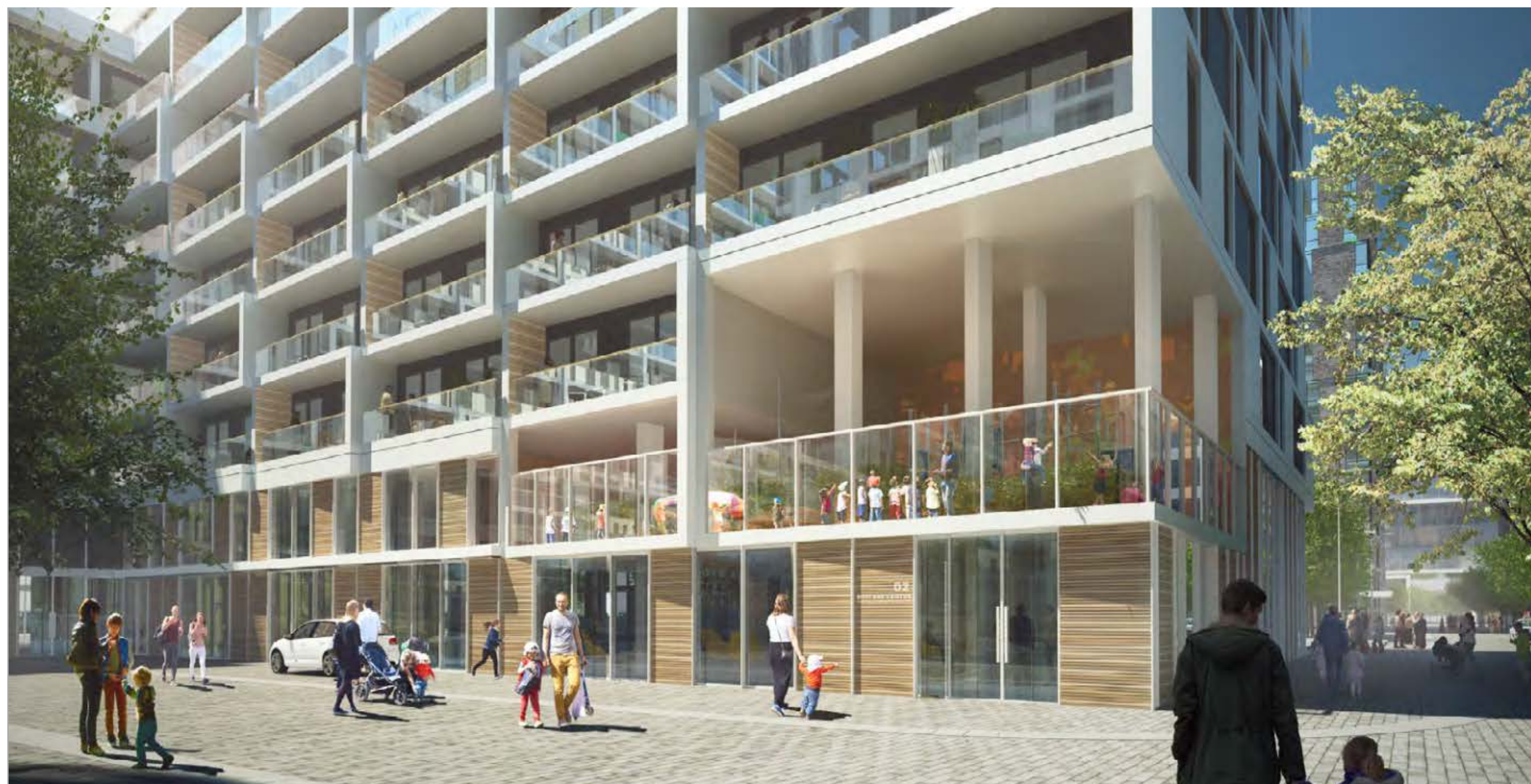
Rendering of the Bayside Toronto development

City divisions and agencies, community agencies and landowners will be encouraged to address CS&F needs by: (a) creating community hubs; (b) co-locating facilities and sharing resources; (c) exploring satellite and alternative delivery models; (d) addressing distribution gaps; and (e) integrating programs and services.