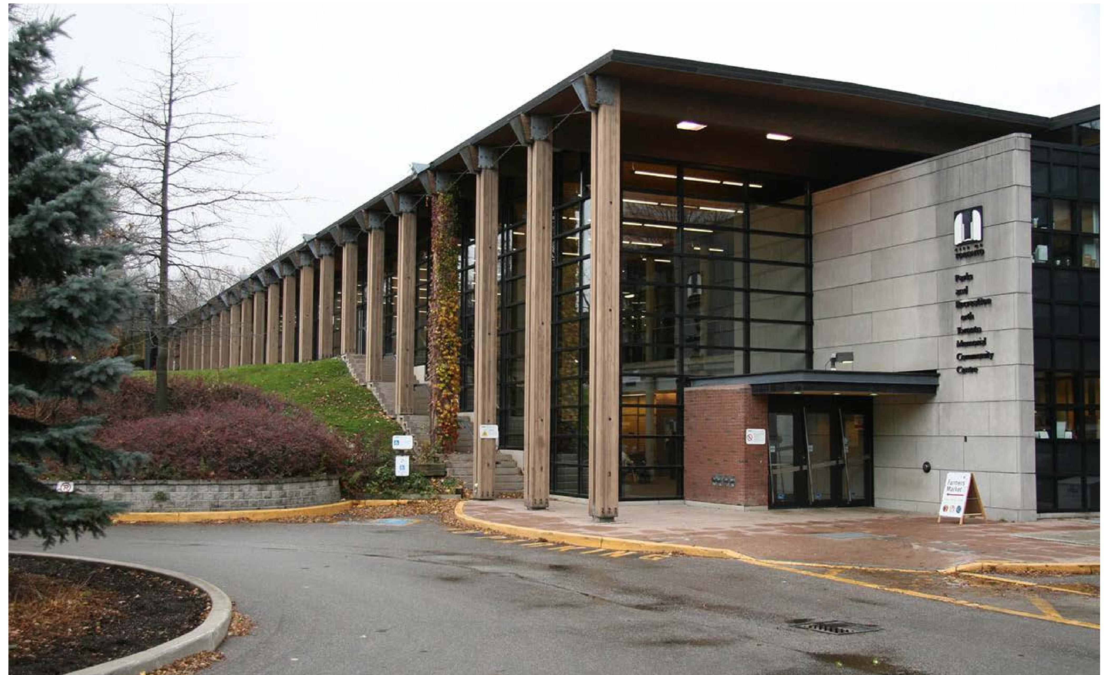
North Toronto Memorial Community Centre

City Planning is working closely with our Divisional and agency partners to identify priority projects and long-term capital plans in the CS&F Strategy to implement the proposed secondary plan policies. (See Potential Opportunities on CS&F Map)