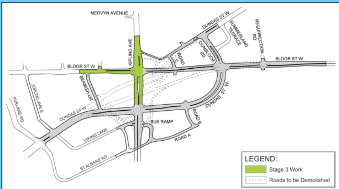
LEGEND: █ Stage 3 Work - - - Roads to be Demolished