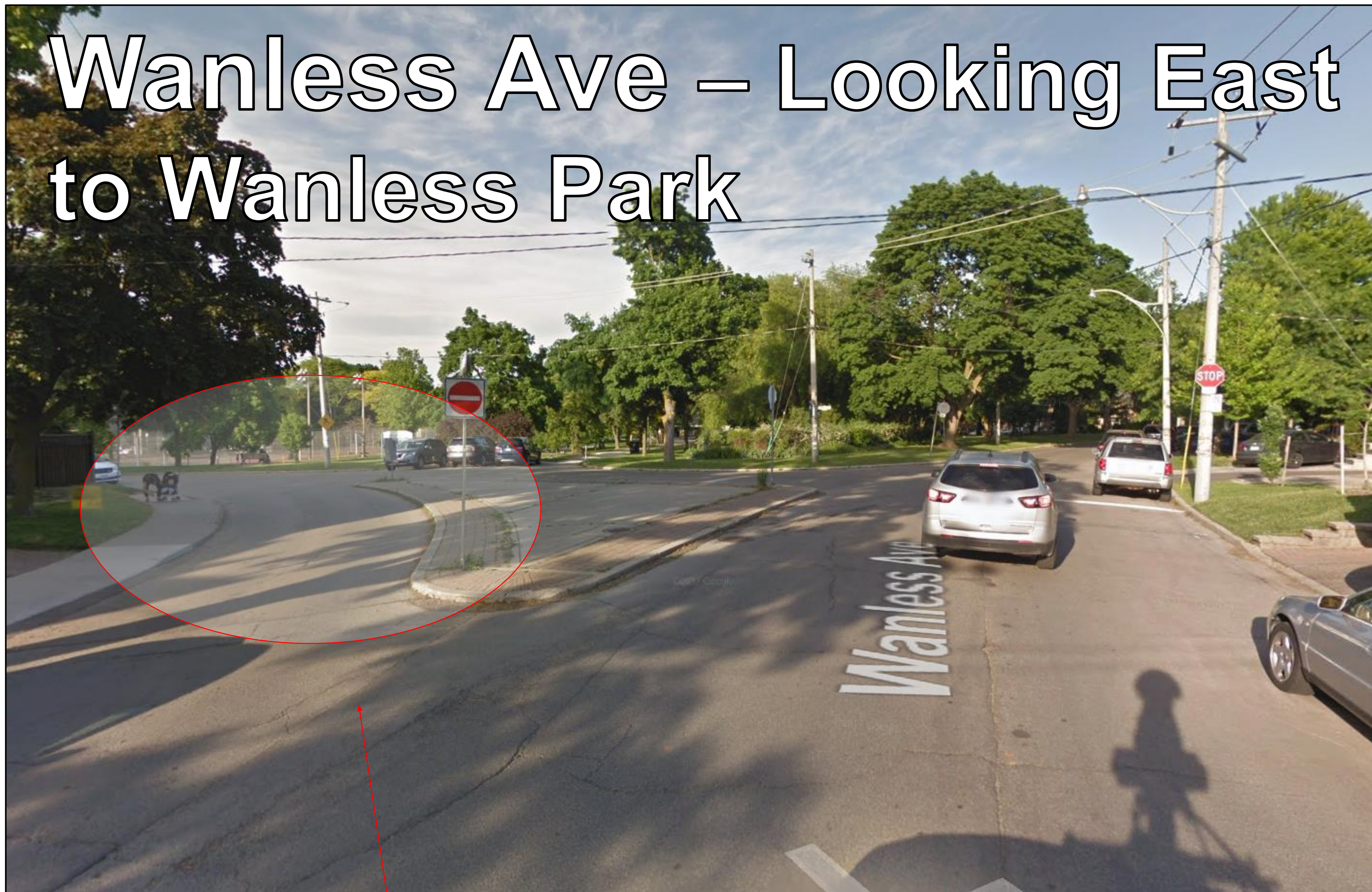
Pedestrian crossing at right-turn channel