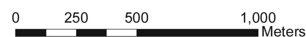
Figure C.8 July 25, 2017