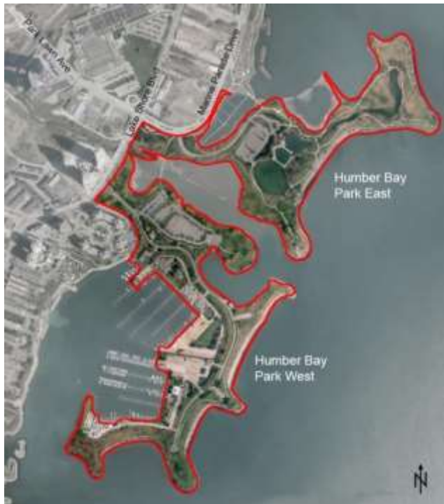
Figure 1: Aerial Map of Humber Bay Park East and West

The Humber Bay Parks offer a quiet, natural refuge for people and wildlife from traffic and high-density development on the waterfront. The parkland covers 43-hectares in Ward 6 on the Toronto Waterfront located at the mouth of Mimico Creek, south of Park Lawn Avenue and Marine Parade Drive.