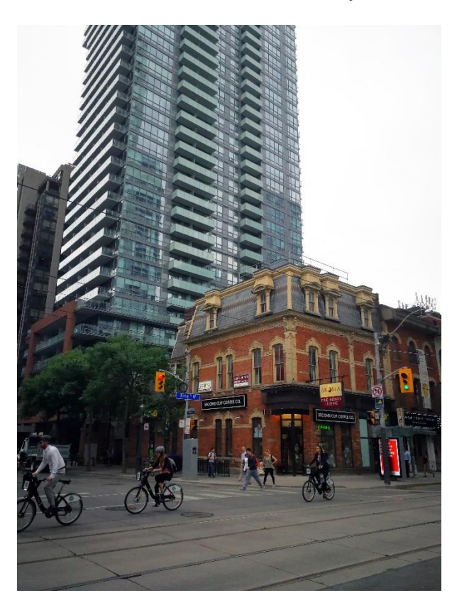
SIDE BAR: Downtown housing means less commuting.

Downtown is seen as an attractive place to live. There is a great degree of social and economic diversity among the Downtown population, accompanied by a diversity of housing types, tenures and affordability. Different communities have different needs in terms of community services and support. Downtown is an inclusive place for vulnerable people and, as growth continues, there is a need to address the threat of displacement and increase supportive services and affordable housing. Planning for Downtown community services and facilities cannot follow a broad city-wide template.