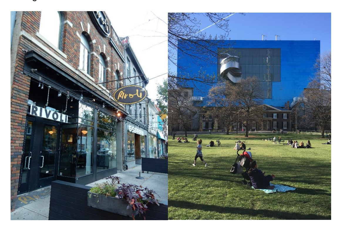
SIDE BAR: Art and culture are key ingredients for a successful Downtown .

There is also an important cluster of arts and culture activities Downtown . From museums, galleries, theatres and performance halls of national significance to small theatre, music and dance companies and individual artists, Toronto's Downtown helps to shape Canadian culture. The City needs to support the important economic contribution that is forged here through arts and culture.