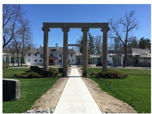
New sidewalk added to entry circle as proposed in Guild Trails Plan

Completion of projects is entirely based on securing future funding. When funding is realized, the recommendations proposed in the preceding section for future horticultural enhancements within the Guild Park and Gardens can be categorized into one of three priority phases: