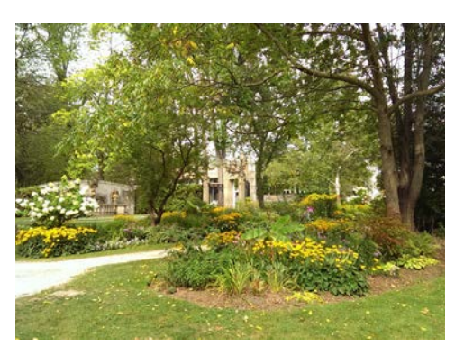
Existing perennial garden beds along the main axis path