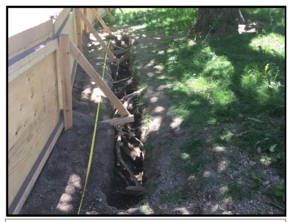
Tree Root Exploration Trench : After surface excavation, a vacuum removes soil to expose tree roots.

During the tree exploration, the contractor will use a specialized tool that uses pressurized air to expose the tree roots without damaging them. Once the tree roots are exposed for viewing (see photo above), a certified arborist will carry out a detailed assessment to determine and minimize any potential construction impact on the tree. The soil that is removed around the tree roots will be replaced and the temporary fencing will be removed.