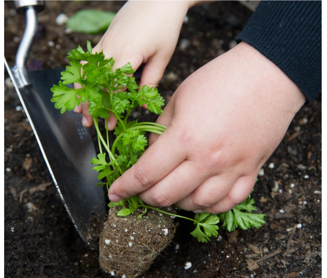
Two hands planting parsley in a garden.