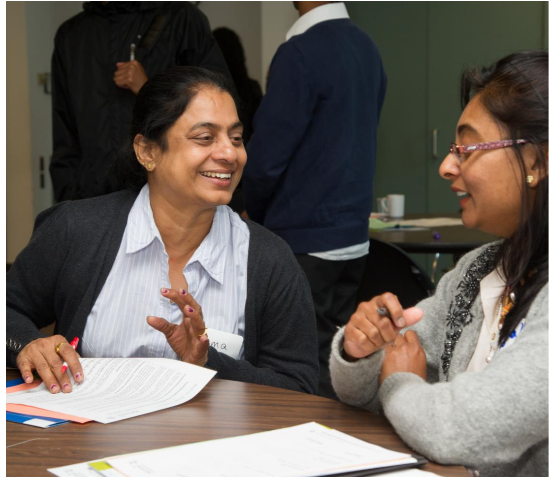
Two women sitting at a table with paper and pens, talking and smiling