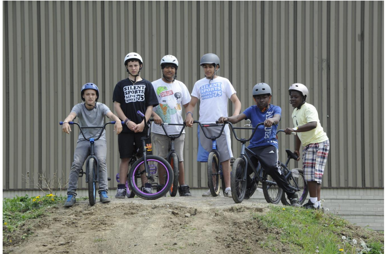
Group of male youth on top of a small hill, standing with their bikes