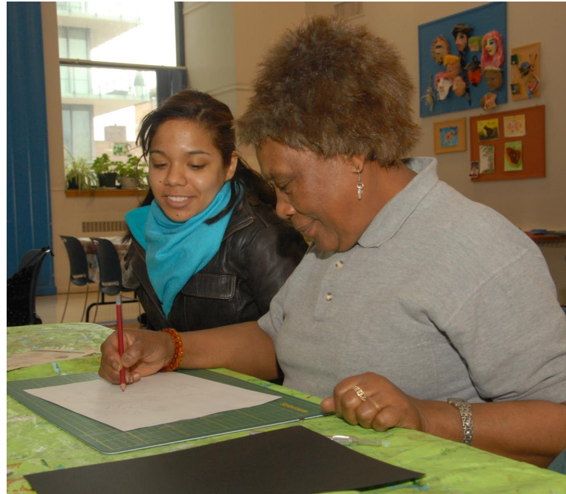
Two women sitting at a table, smiling. One woman is writing with a pencil on a piece of paper.