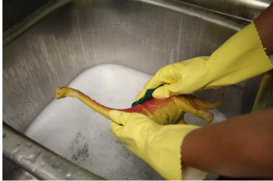
1 st Sink: Wash with detergent