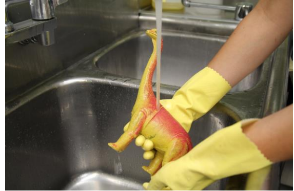
2 nd Sink: Rinse with clean water