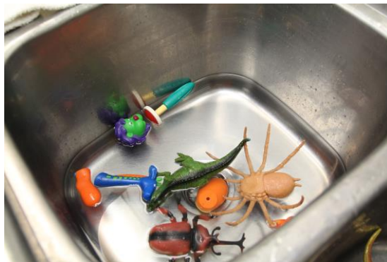
3 rd Sink: Disinfect