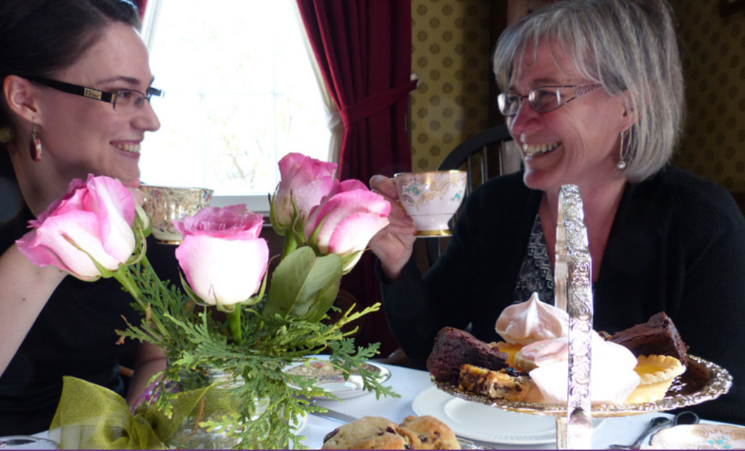
Project Mackenzie by EnvisionTO