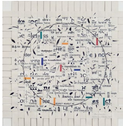
Amy Loewan RCA, Forward with Peace