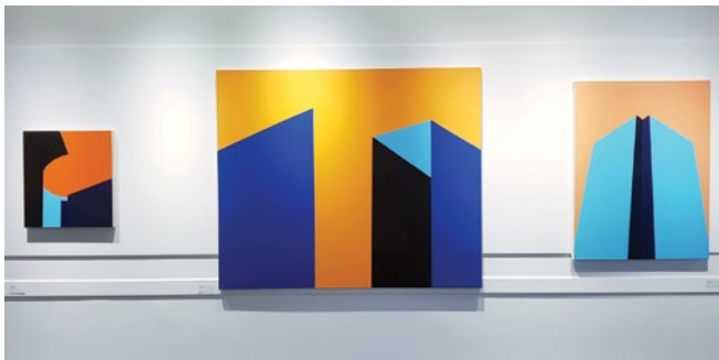
Artwork by Isaac Watamaniuk