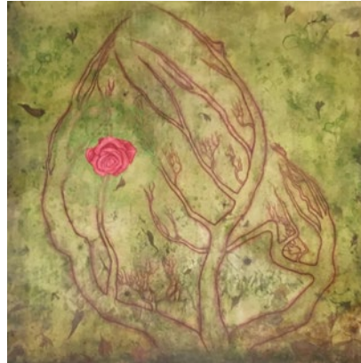
Yoan Barrios, Untitled