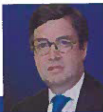
LUIS ALBERTO MORENO

President Inter-American Development Bank (IDB)