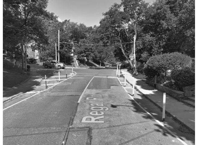
Interim design installed in June 2018

The residents then approached the former Councillor's office to see if a more permanent solution could be installed at the intersection. The Councillor's office organized a public meeting in March 2018, and two meetings were also organized by the Regal Heights Residents Association. Permanent intersection modifications were discussed at these meetings and requested from the City. The City advised that this intersection was not scheduled for work within the next five years, but suggested a temporary intersection modification that could be completed with potential greening opportunities. The Councillor's office and participating residents agreed with this approach.