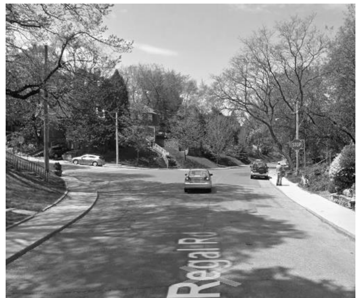
Regal Road and Springmount Avenue intersection prior to the pilot project