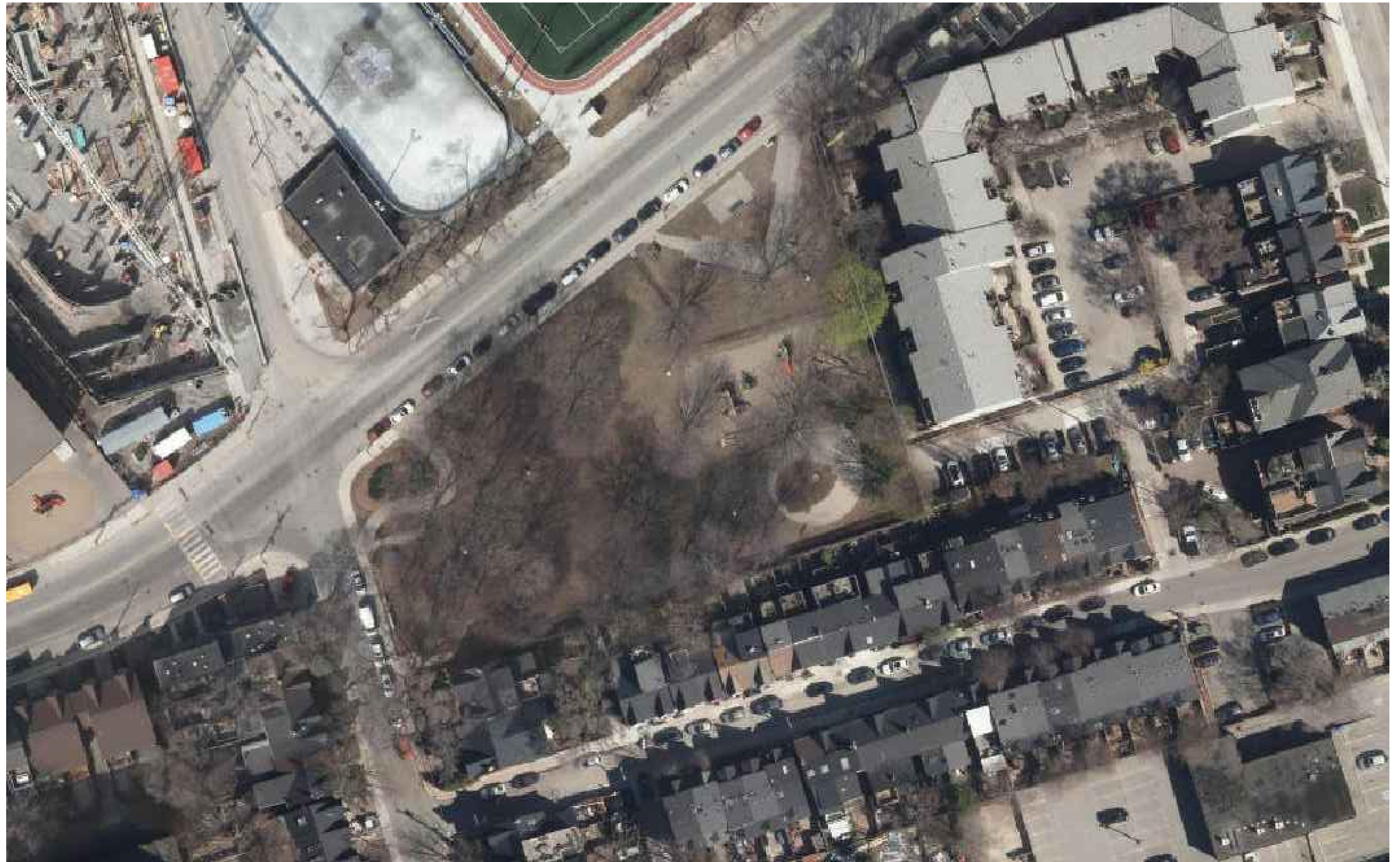
THE GRAPHIC PANEL ABOVE IS AN AERIAL PHOTOGRAPH OF SUMACH-SHUTER PARKETTE.