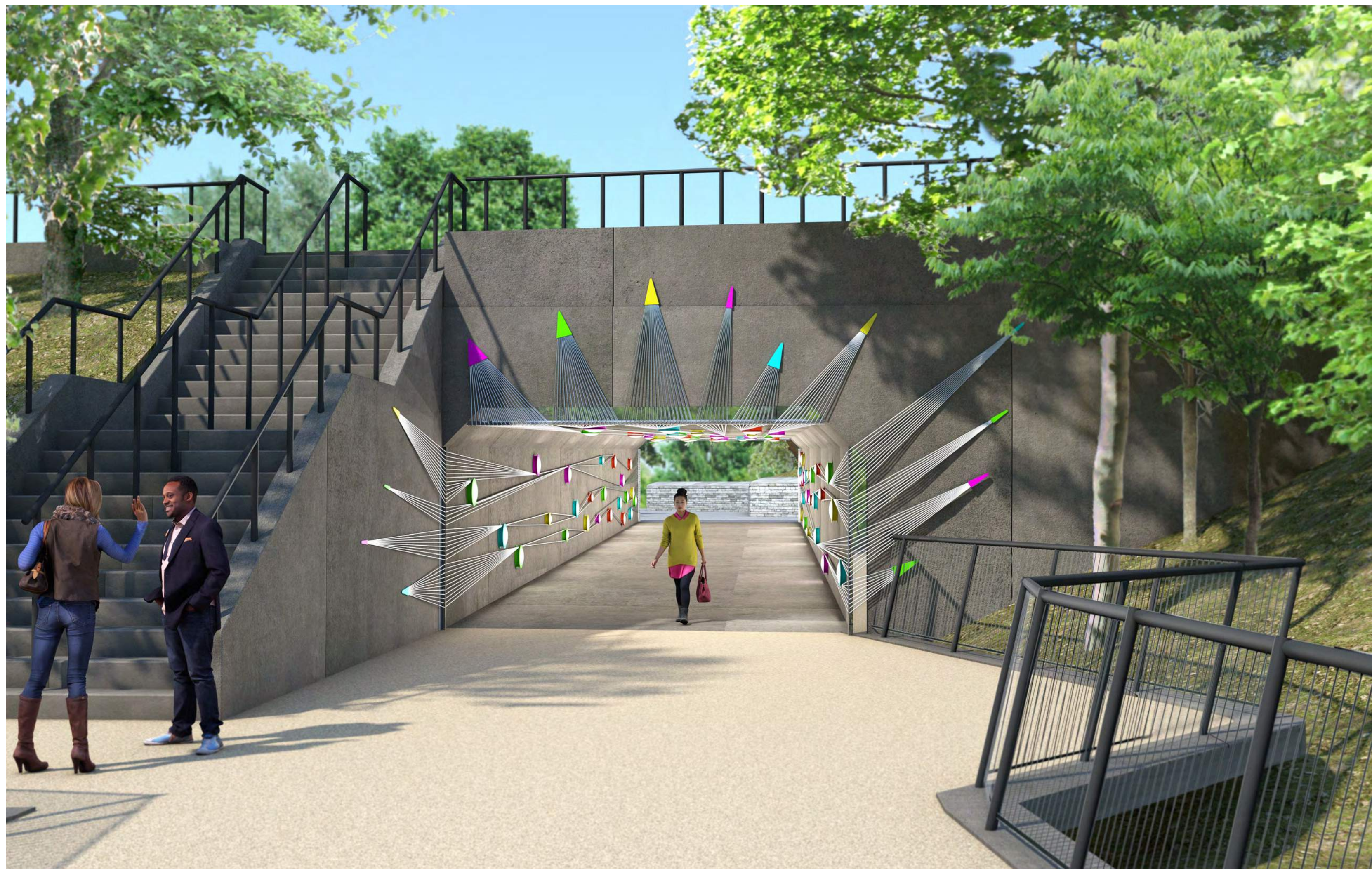
View of north tunnel entrance.