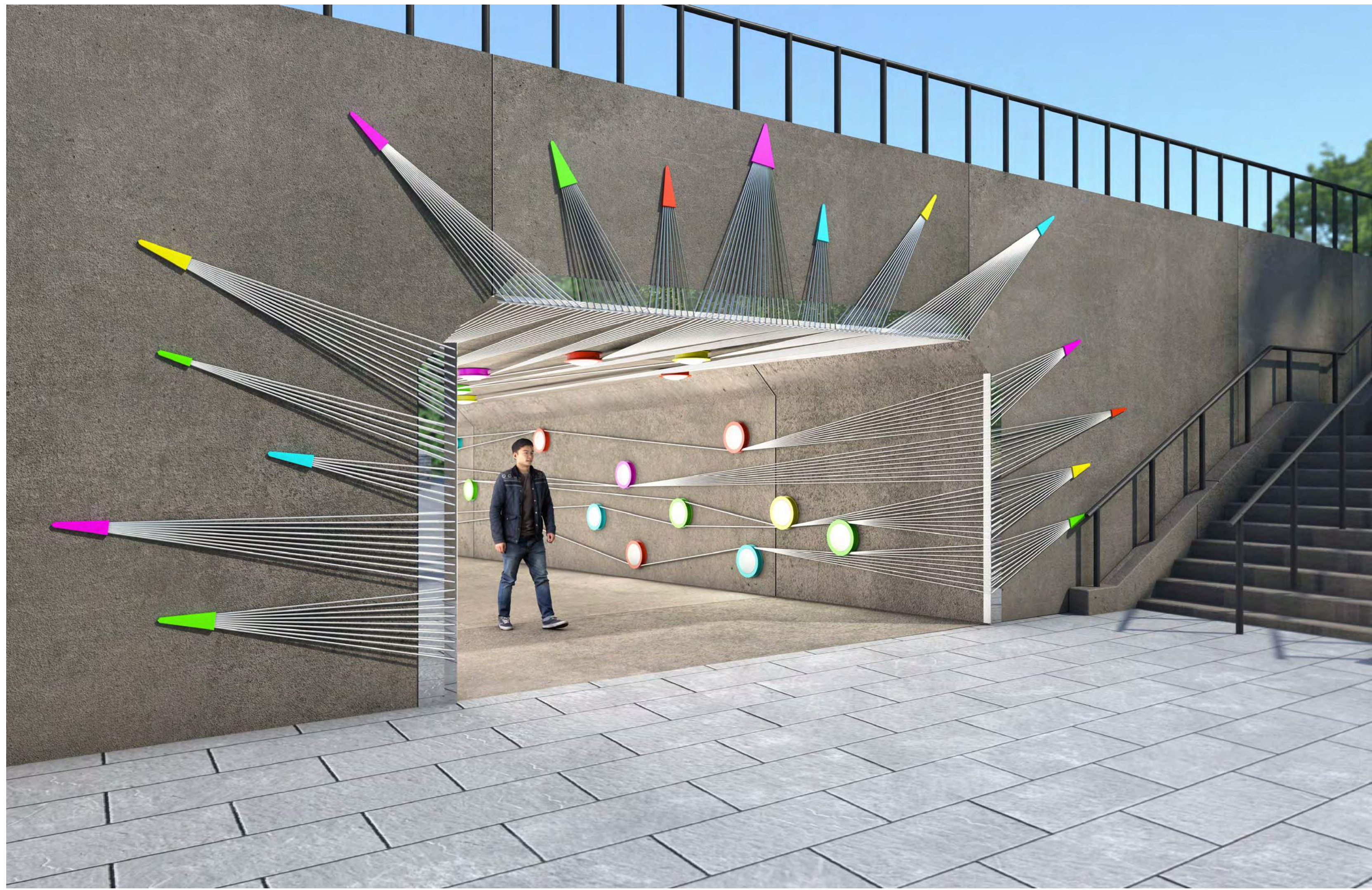
View of south tunnel entrance.