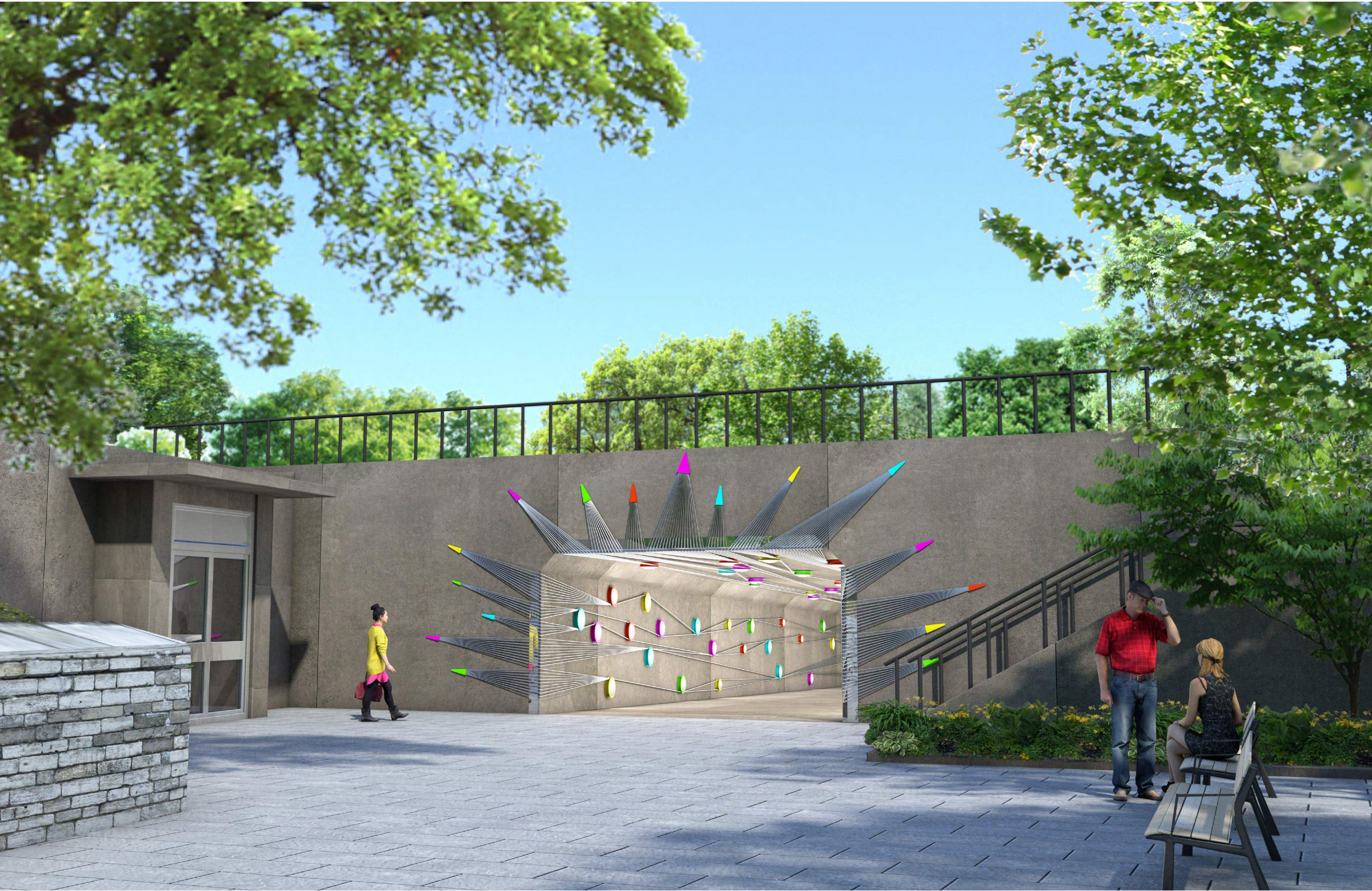
View of tunnel entrance from south plaza.

The work responds to the site’s structural and organisational specificity by making this tunnel into a communication channel. The linear patterns are based on the flow of crossings through the tunnel, like the representation of a pedestrian network.