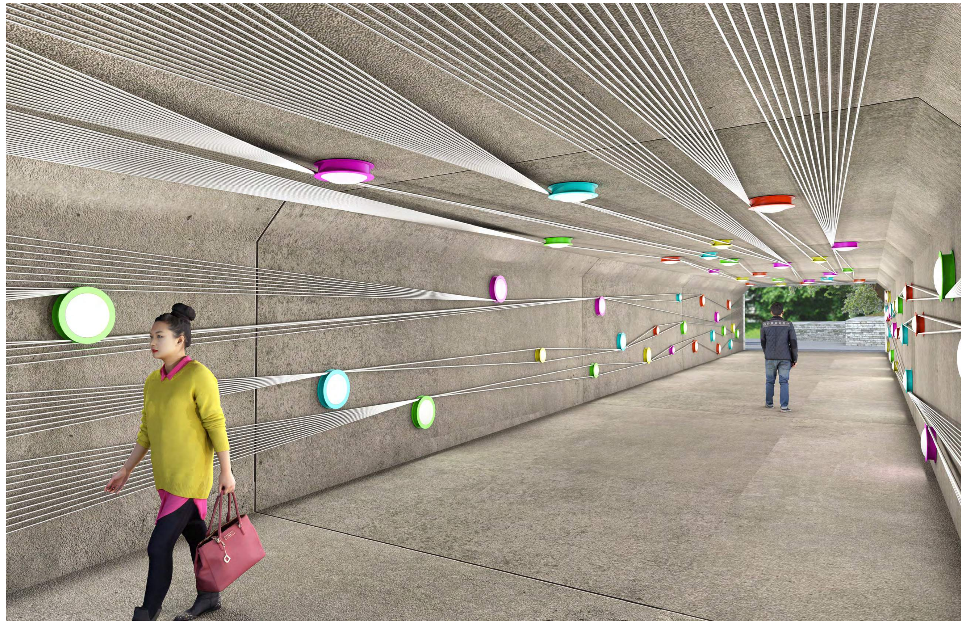
View of tunnel interior.