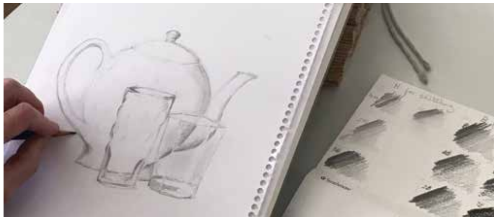
Texture, Depth and Tone

Get up close to objects. Learn how to master a still-life, while improving your drawing and painting skills. Duplicate shiny/reflective surfaces, liquids, crystal and food. Perfect for beginners and experienced painters wanting to brush up on making objects appear real.