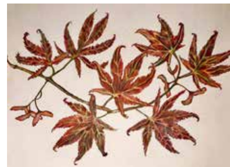
Japanese Maple Leaves drawn in pencil crayons by Carole Mandel

Expand your working knowledge of painting using acrylic or oil. Elements of perspective, shape, colour, value and texture are examined. Individual instruction will help students delve into aspects of their preferred media. No solvents.