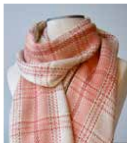
Caitlin Barrie Textile

Learn how to make a naturally dyed silk scarf using traditional methods of Japanese tie-dye, known as Shibori. Participants will learn to how fold, clamp and dye