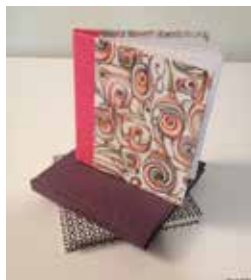
Caitlin Barrie Textile

This course will introduce students to the tools, materials and techniques of traditional bookbinding. Students will learn to create beautiful hand-made booklets,