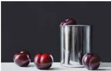
High Realism by Ian Bodnaryk