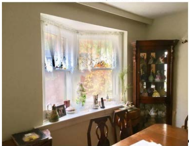
Dining room with lower bay window. Photo taken by Roger Greathead around 1:30 pm on October 22, 2018.

Ms. O'Reilly expressed concerns about the loss of light to two windows in her house that face south (see photo left). Because the current garage is one storey, her house has the unusual benefit of somewhat unobstructed windows in the middle of her building. These will be blocked by the new three storey building that is proposed to be erected.