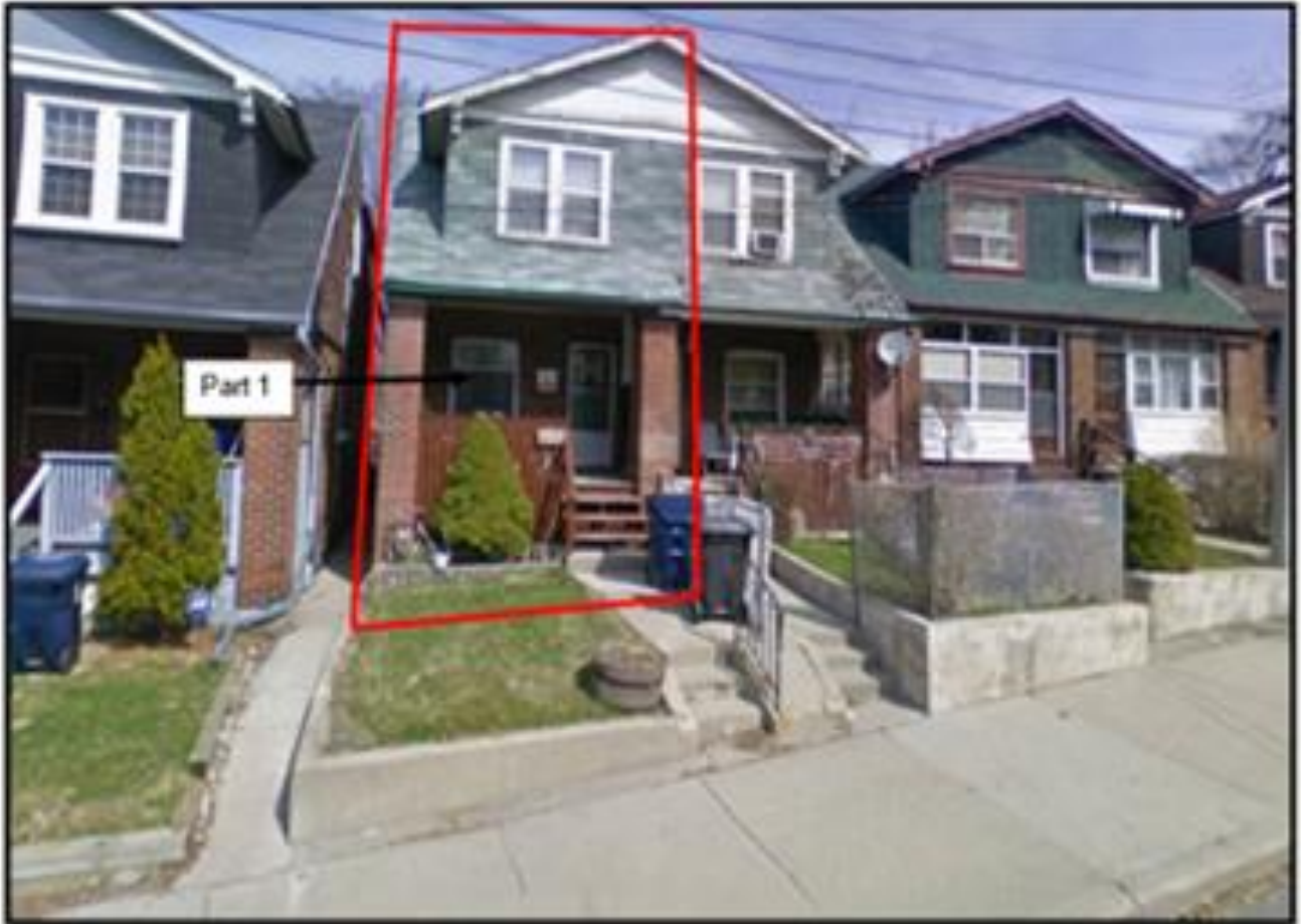
Street View of 40 Darrell Avenue