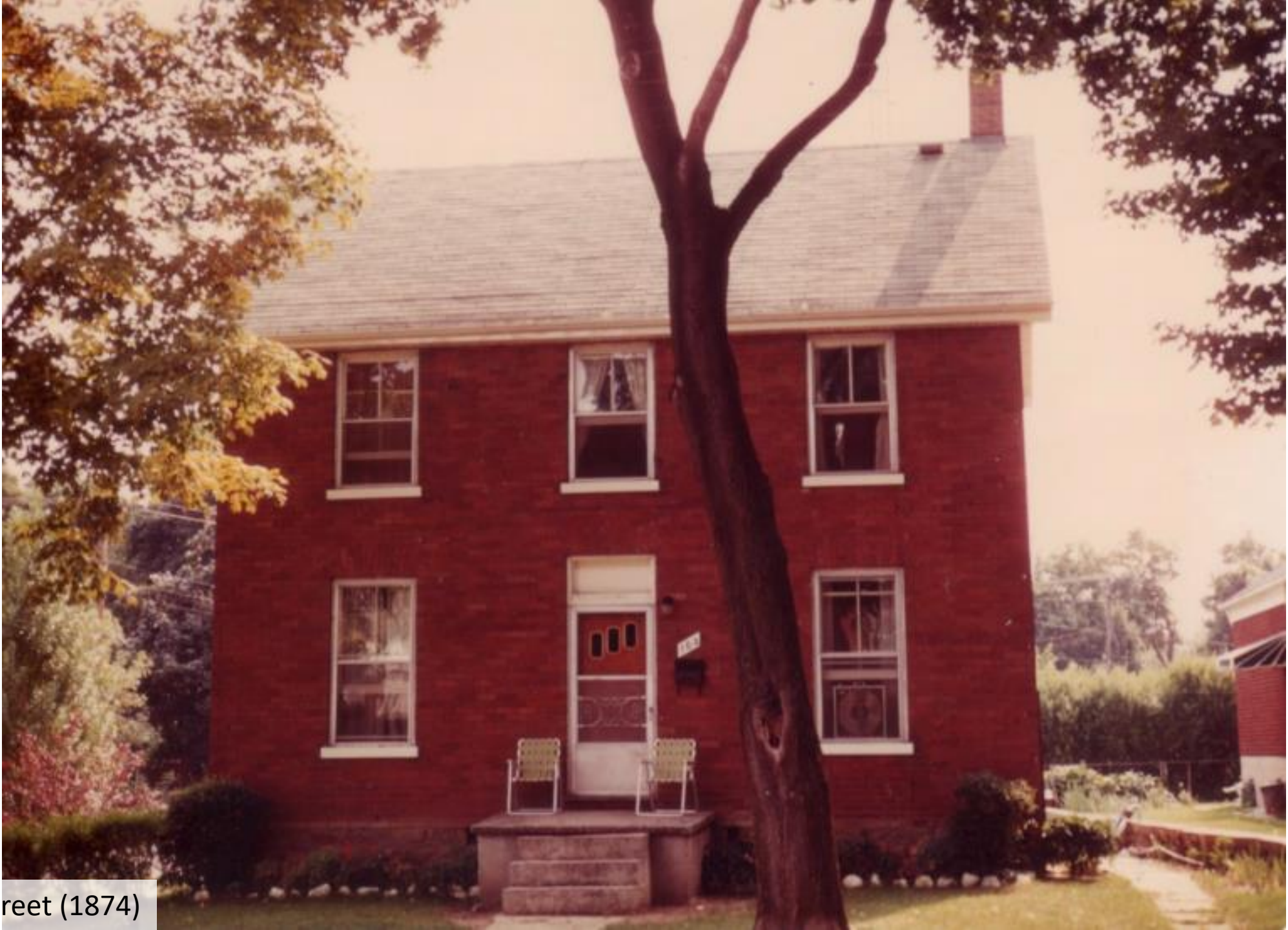
103 King Street (1874)