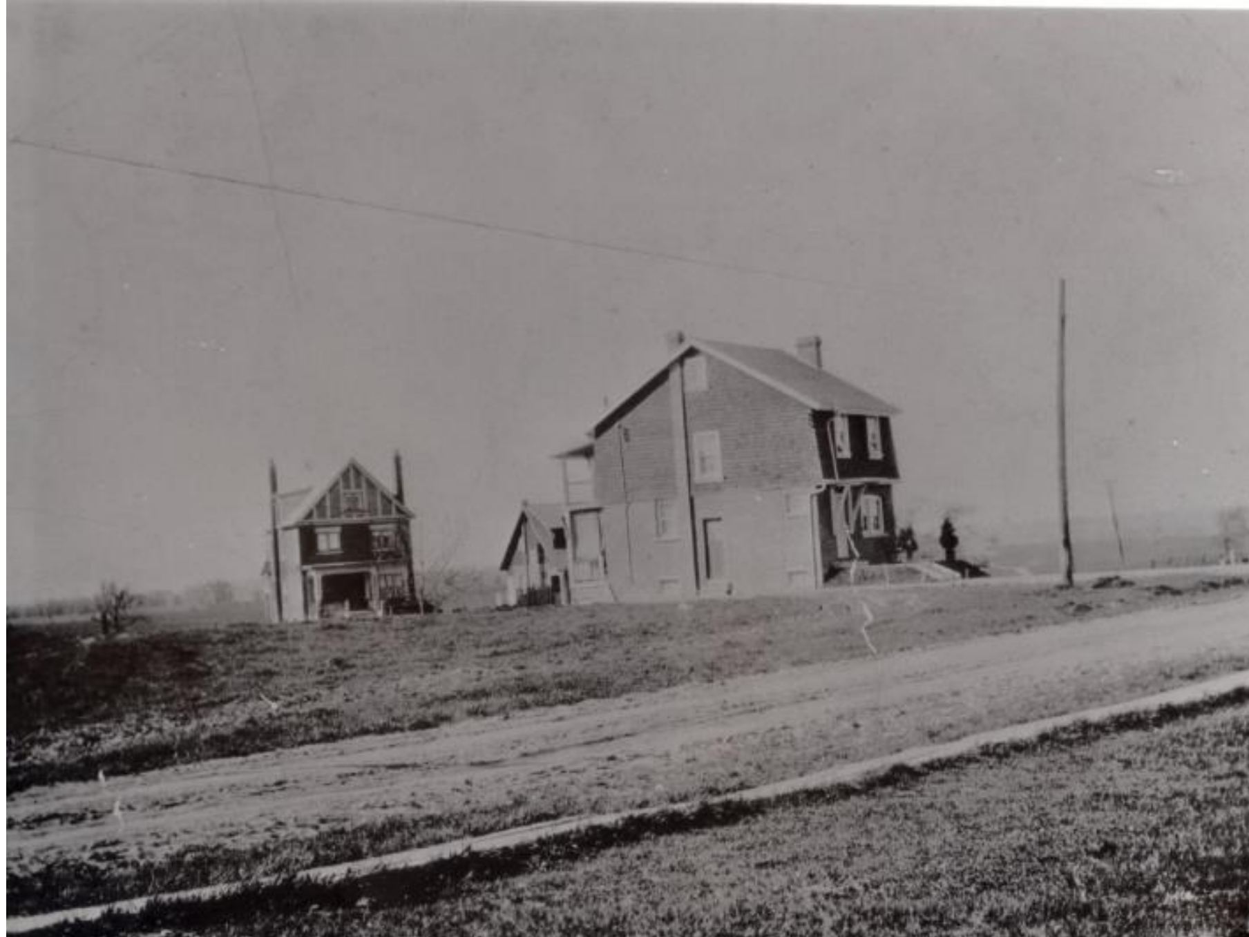
Detail of Joseph Street (pre-1924)