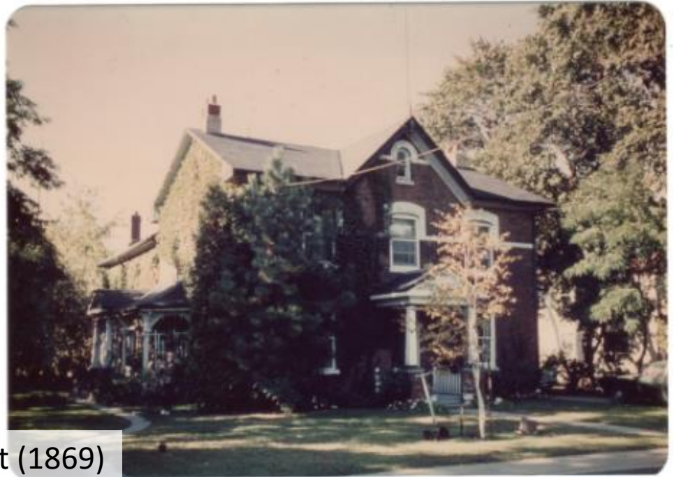
8 William Street (1869)