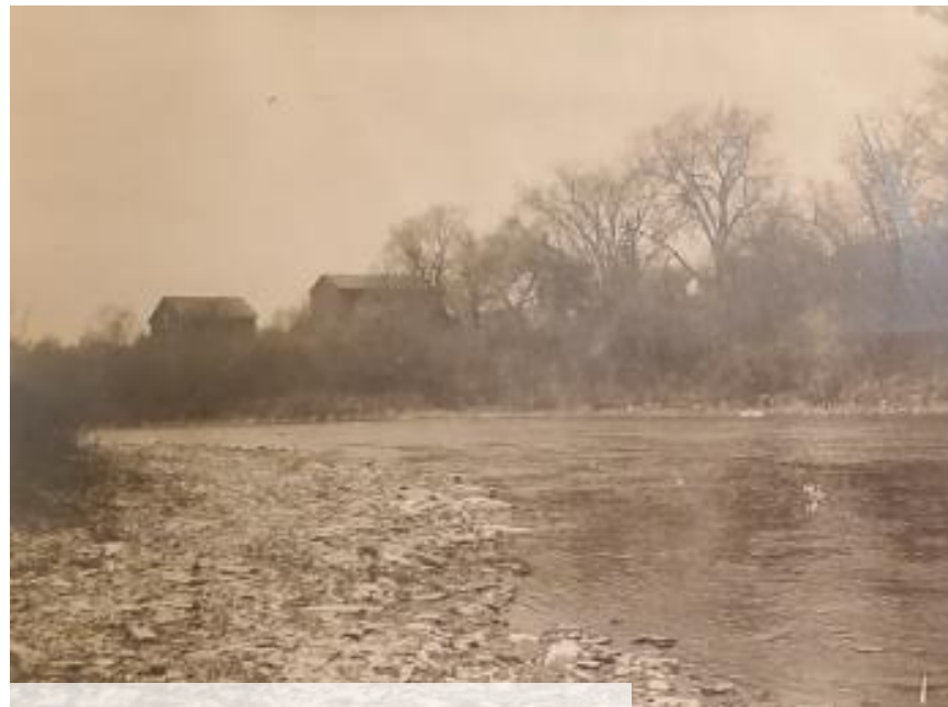
Views of the Banks of the Humber River in Weston on 29 April 1906