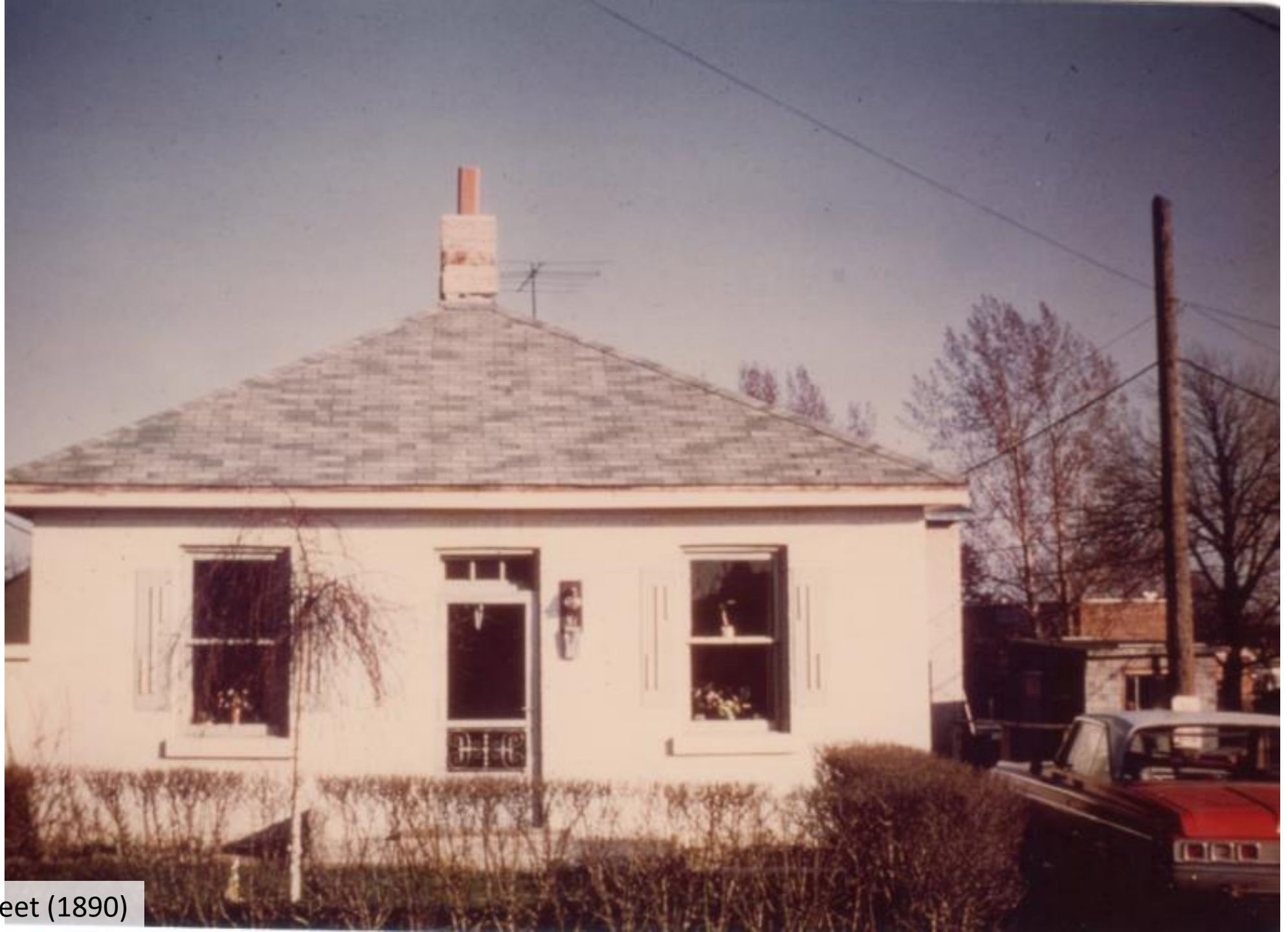
51 Church Street (1890)