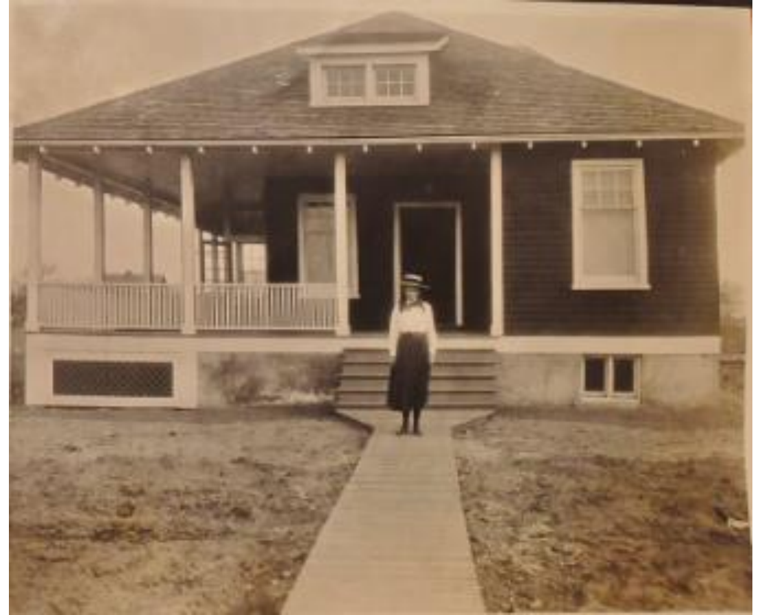
J B Tyrrell House in Weston in 1910