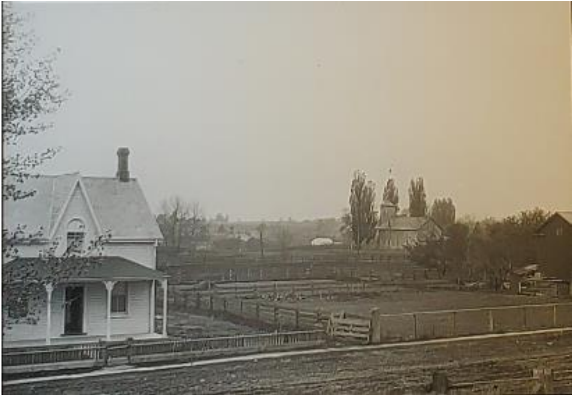
View Looking Westward From Tyrrell Homestead in November 1888