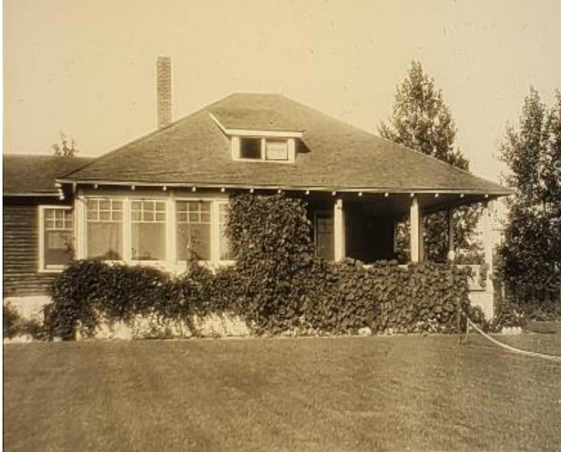
J B Tyrrell Cottage in Weston in 1917