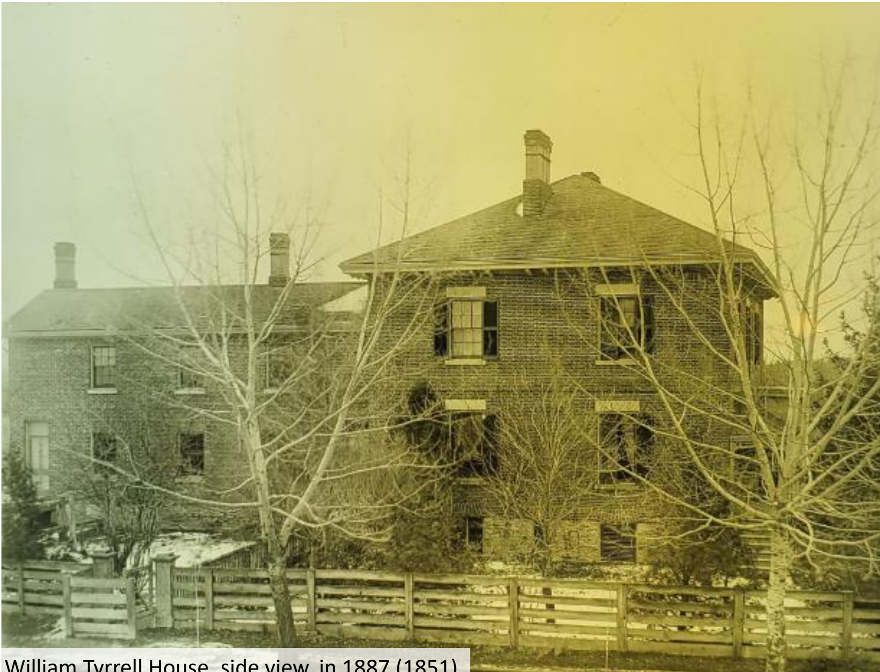
64 King Street, William Tyrrell House, side view, in 1887 (1851)