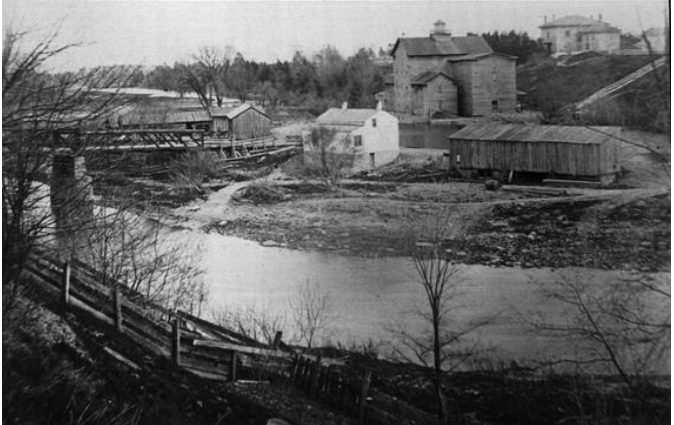
The Wadsworth Mills on the Humber River in Weston (c.1870)