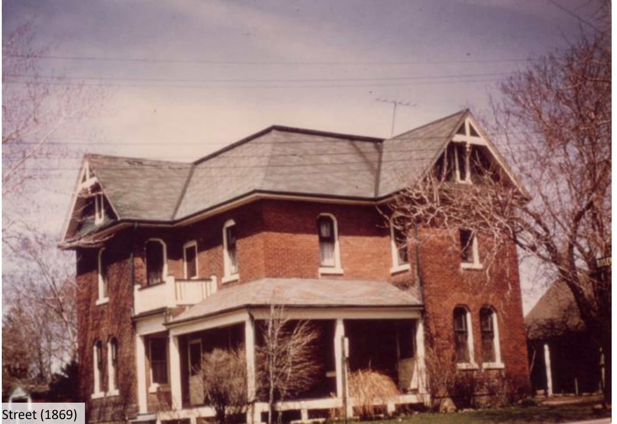
52 Church Street (1869)