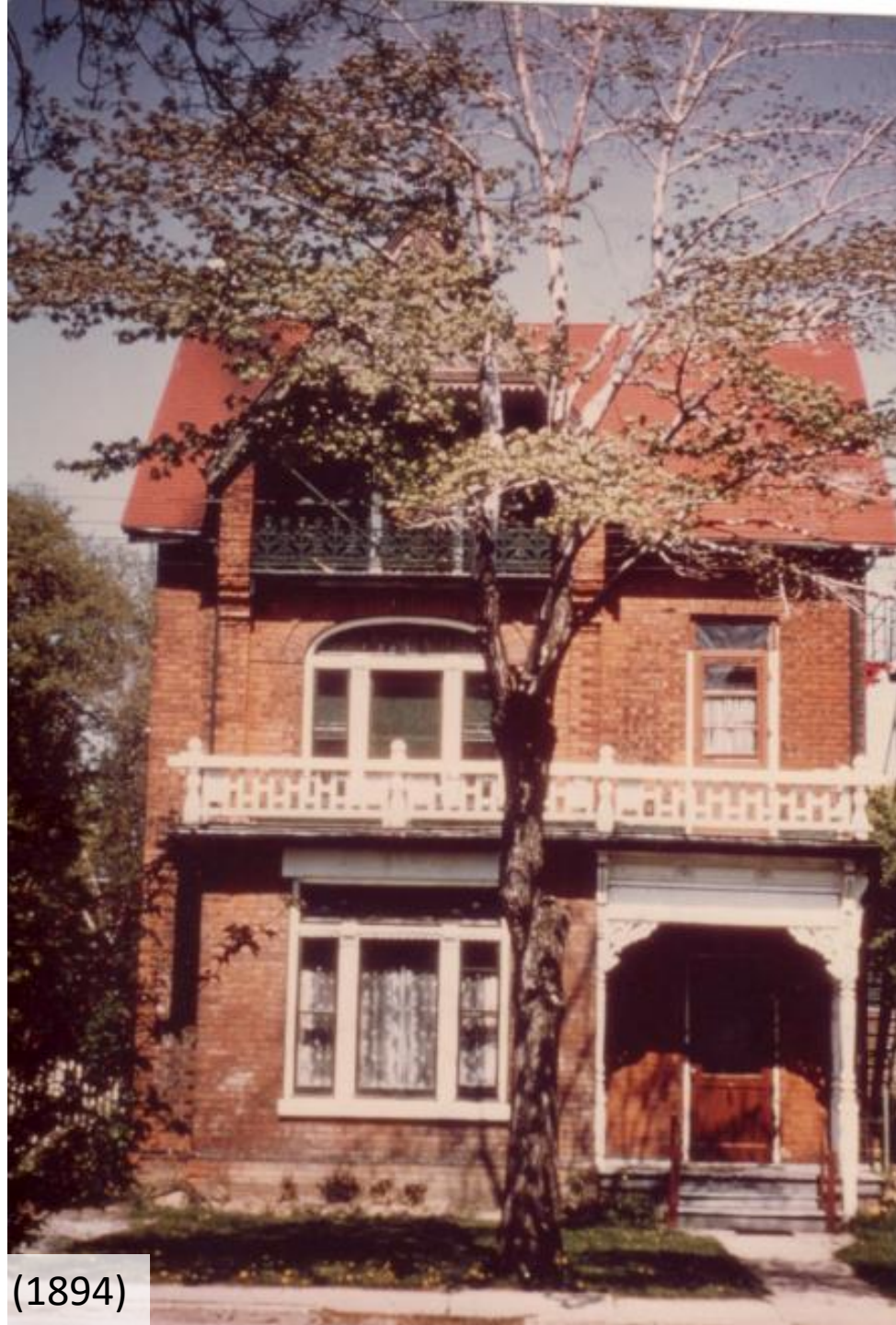
4 Queens Drive (1894)