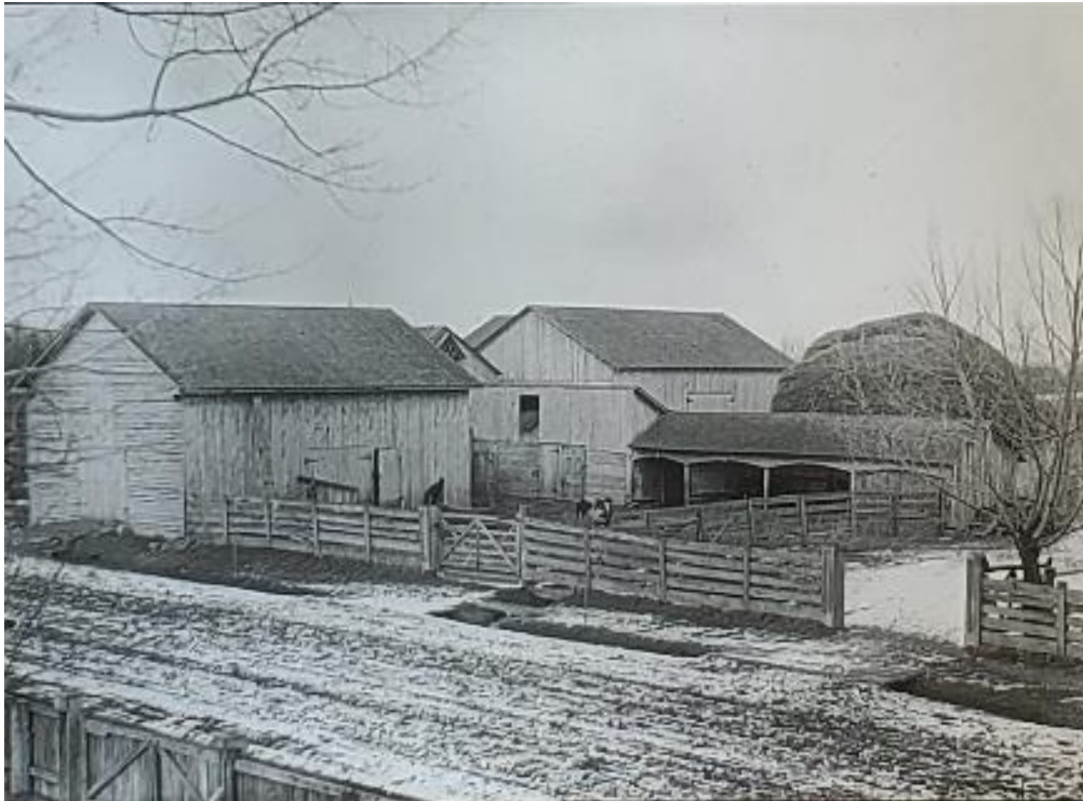
Detail of William Tyrrell Property "The Homestead" in 1887