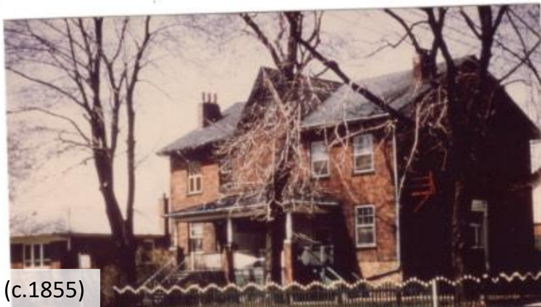
56 King Street, Rowland Burr House (c.1855)