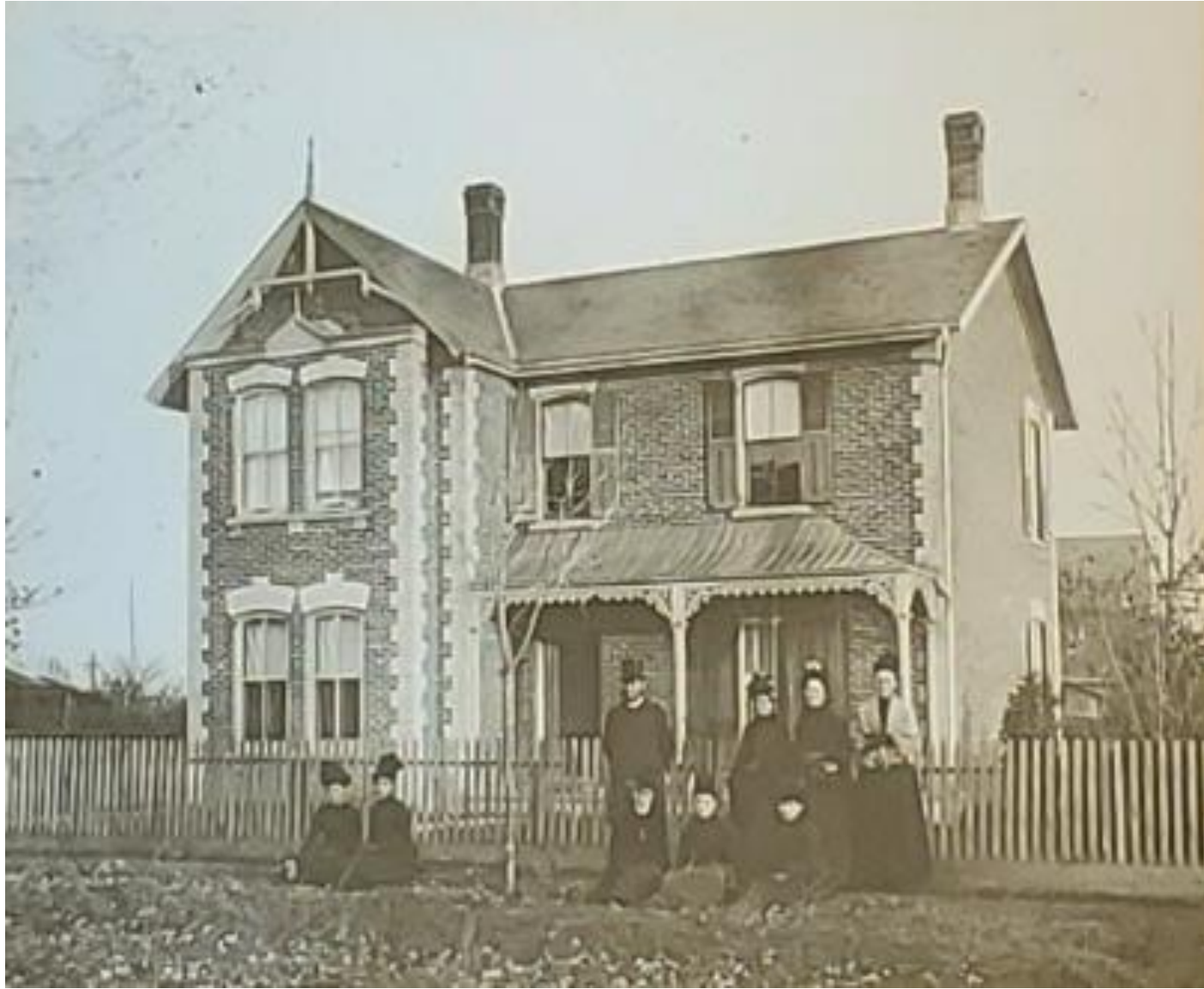
Weston Wesleyan Methodist Church Parsonage in Weston in 1888