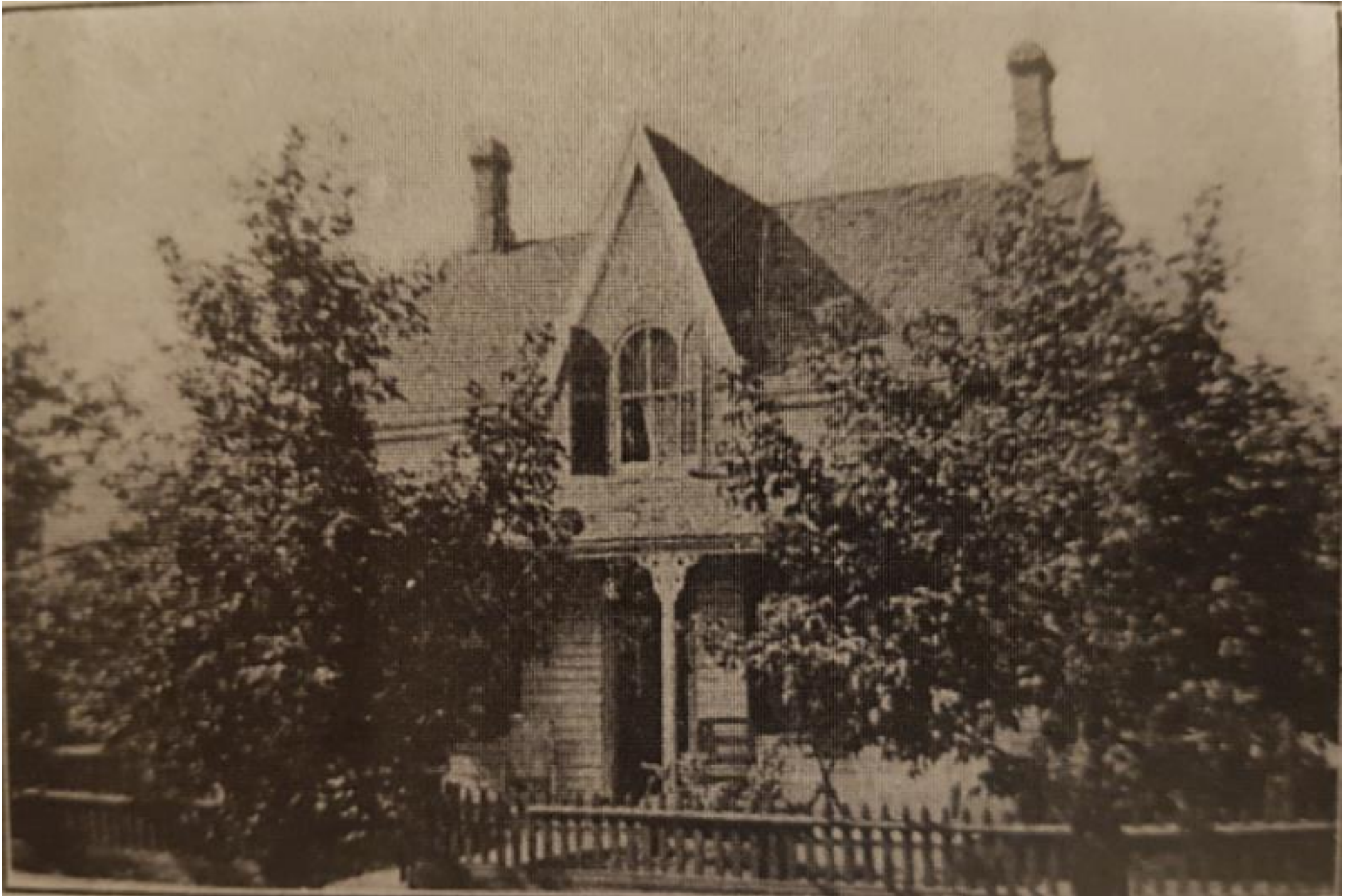
130 Rosemount Avenue (1890)