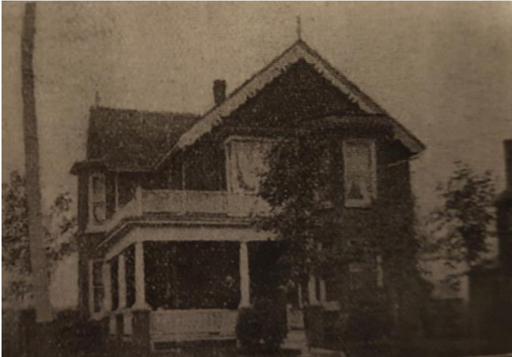
78 King Street, J.H. Taylor House (1898)