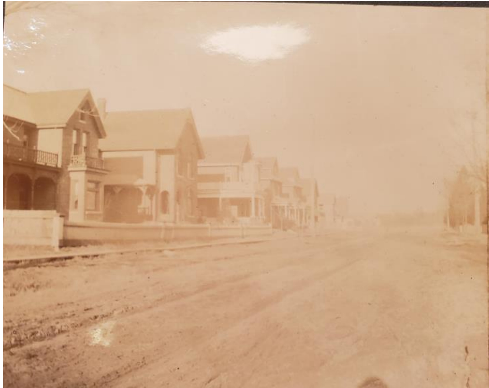
Detail of a streetscape in Weston (1906)