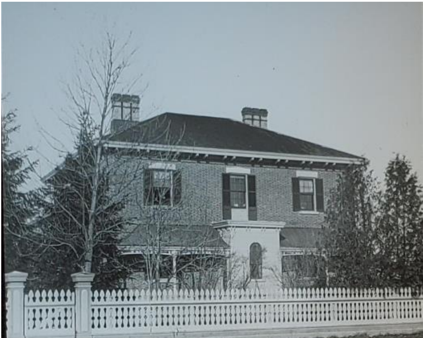
64 King Street, William Tyrrell House in 1887 (1851)