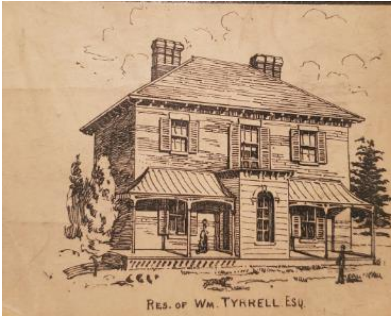
64 King Street, William Tyrrell House (1851)