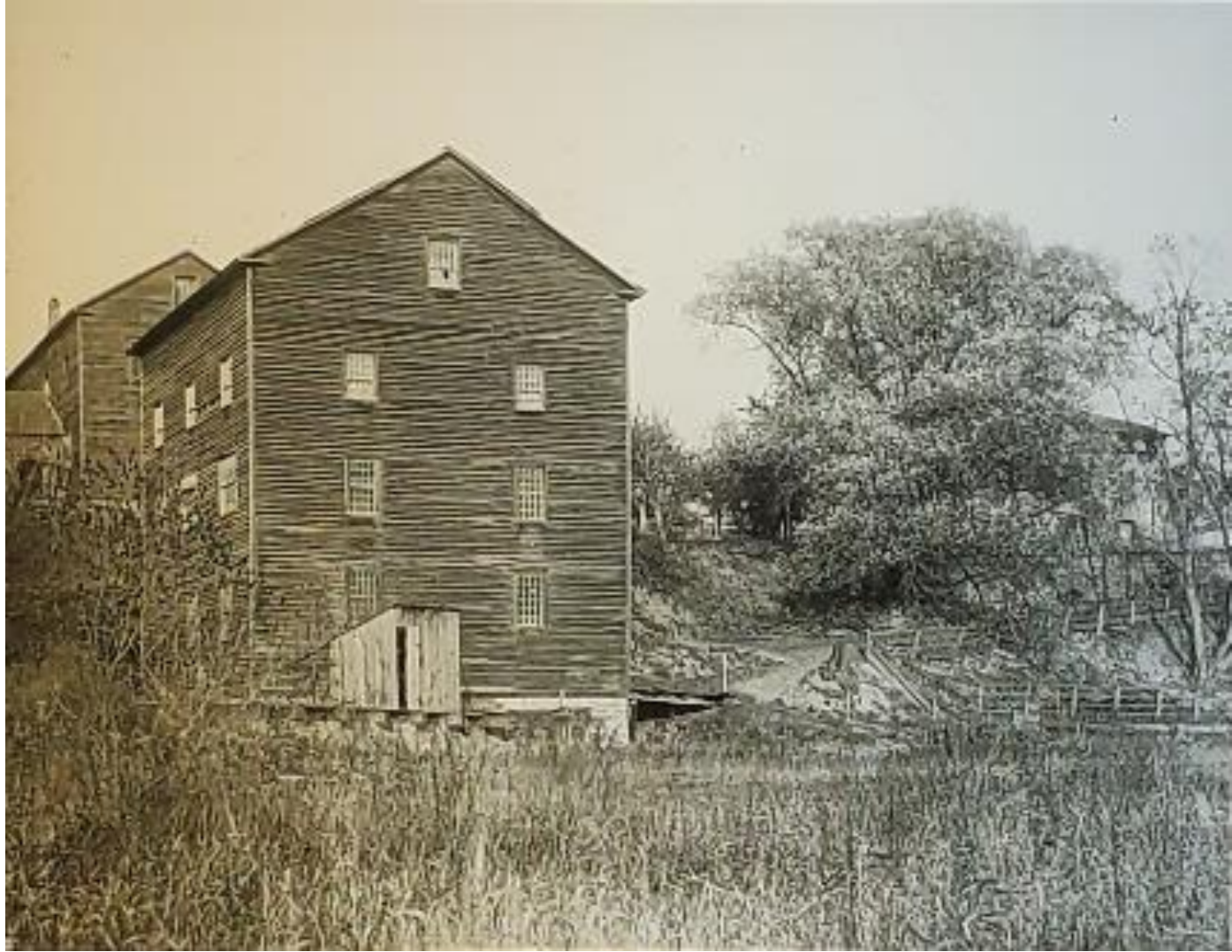
McDougall's Old Mill in Weston in November 1888