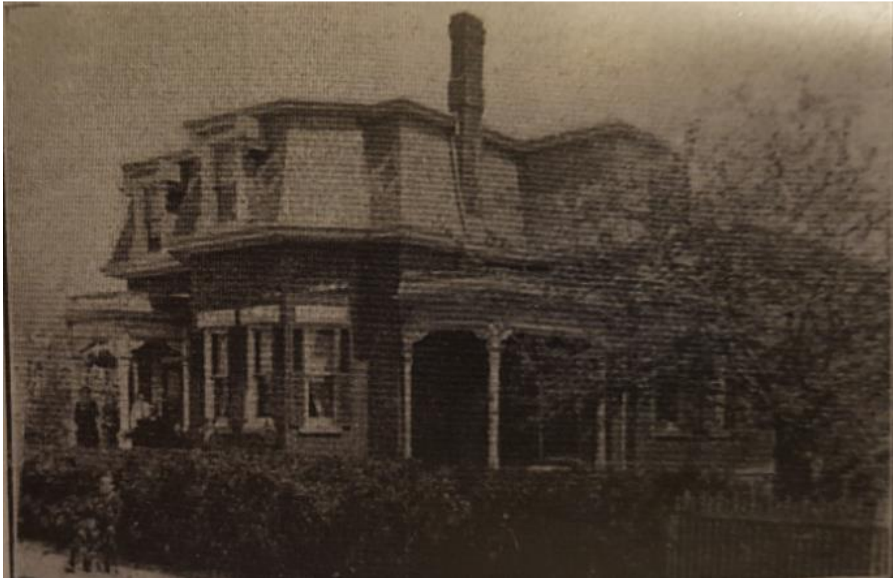
65 King Street, J.T. Farr House (1884)