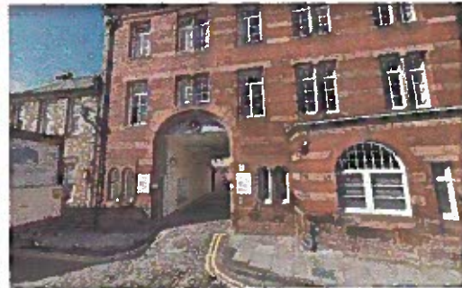
Richmond Place Reception Desk