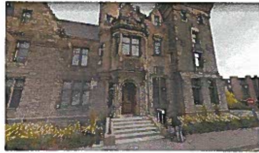
St. Leonard's Hall