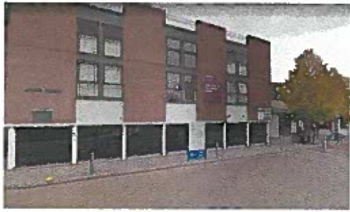
John McIntyre Conference Centre