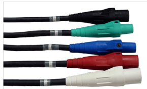
Bare End Tails

For all bare end tails, the stranded or solid wire must be contained in a ferrule (a ring or cap, typically a metal one) or copper tape so that there are no loose strands (see diagram below).