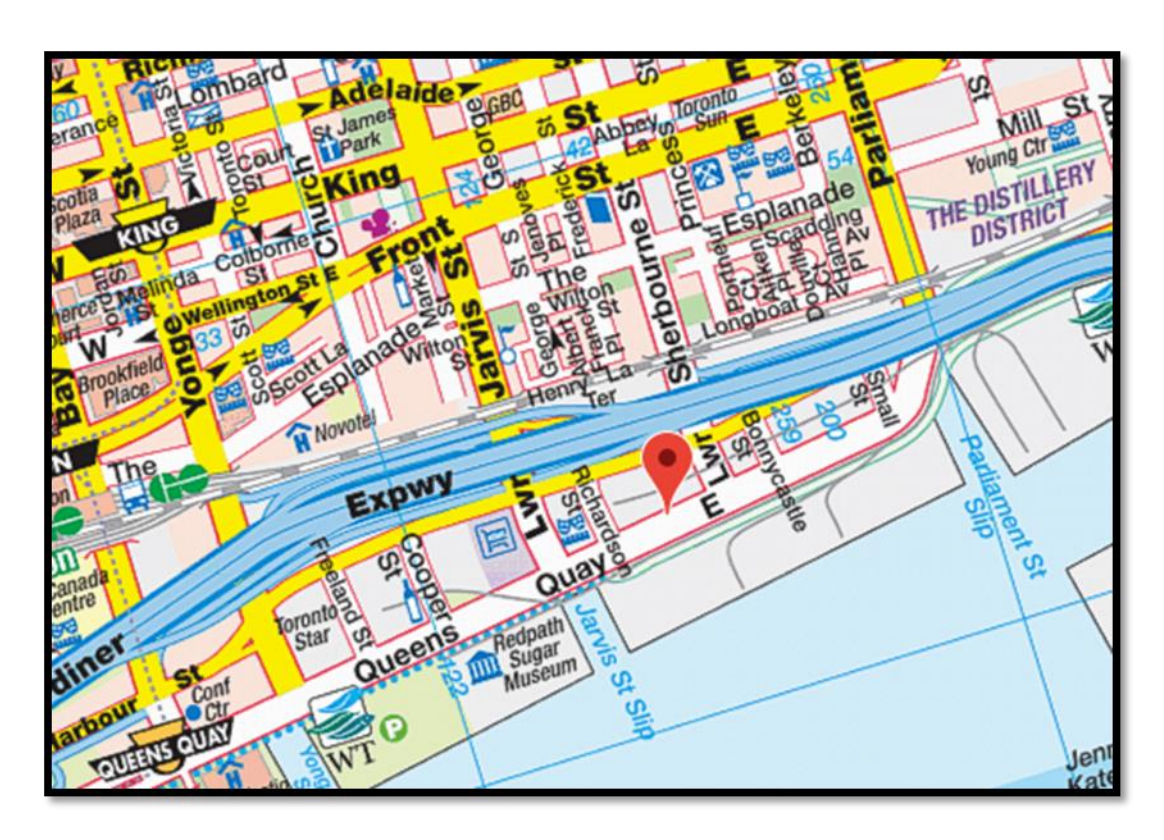
Appendix "A" Site Map, Aerial Maps