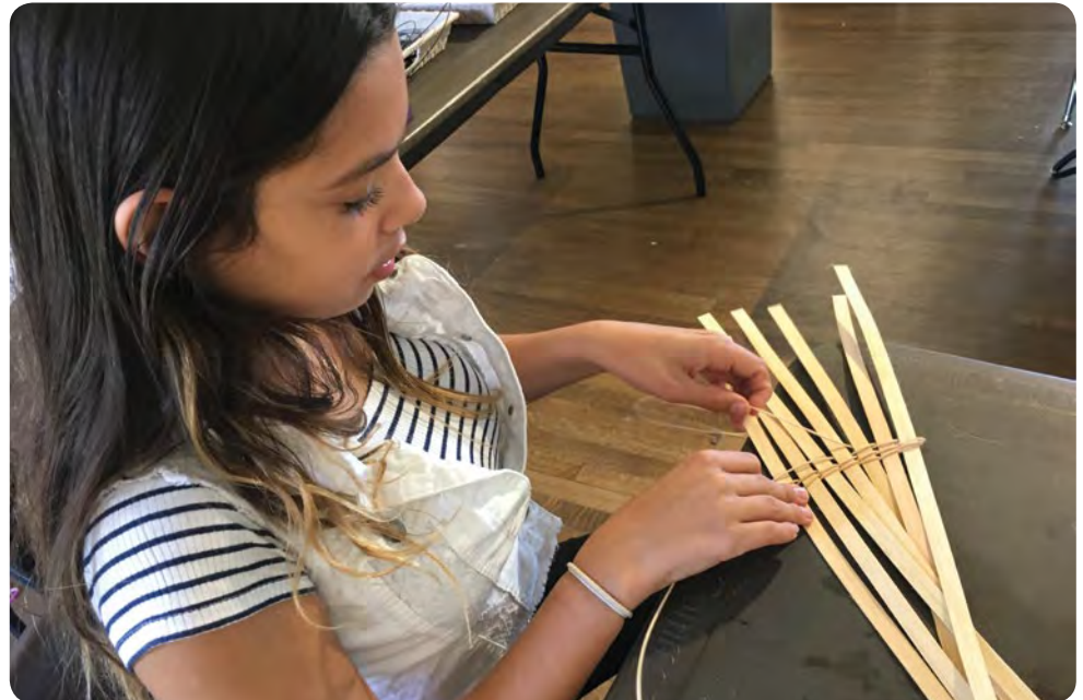
Wall hanging basket workshop

shapes and designs by using carving tools (metal stamps). Lines, grooves and patterns, are pressed, stamped and punched into the leather. In this workshop you will design and dye a personalized bracelet or a bookmark to create a work that will last a lifetime. Price includes materials.