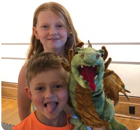
Family Fun at the Cedar Ridge Fringe Festival

Cedar Ridge Creative Centre offers a summer visual arts day camp for children ages 8 to 13 years. Campers have opportunities to create, learn and experiment in scheduled, instructional workshops that include drawing and painting, printmaking, sculpture, video art, and pottery, as well as recreational and arts & craft programming. Sessions run for two weeks.