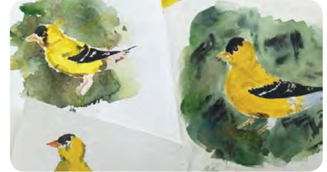
Golden Finch study by Tanya Atkins

Explore the science and art of colour through mixing hues, tints, shades and tones. Practices in accurate colour matching and achieving colour balance and harmony will be demonstrated. By the end of the course, students will learn the methods of constructing a cohesive colour palette and the importance of working within a selective colour spectrum.