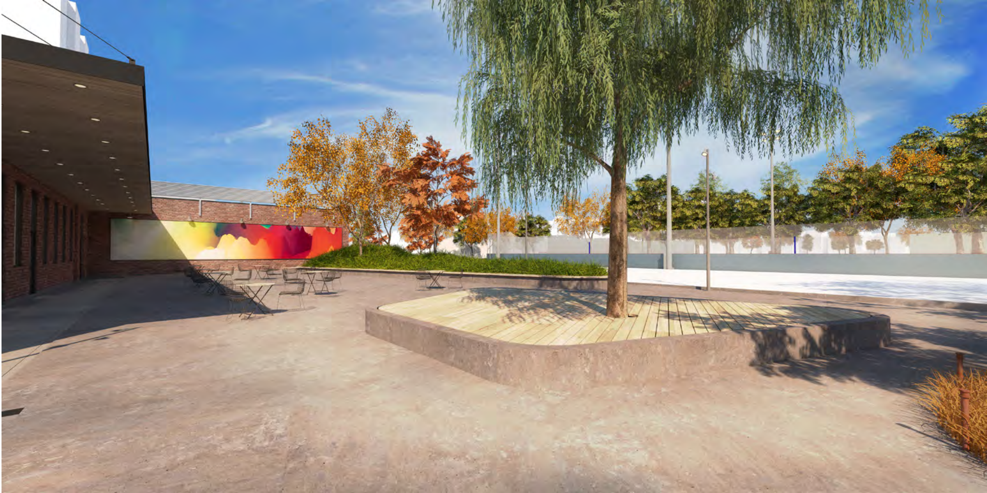
Option 3 view looking north (canopy possible in all options)