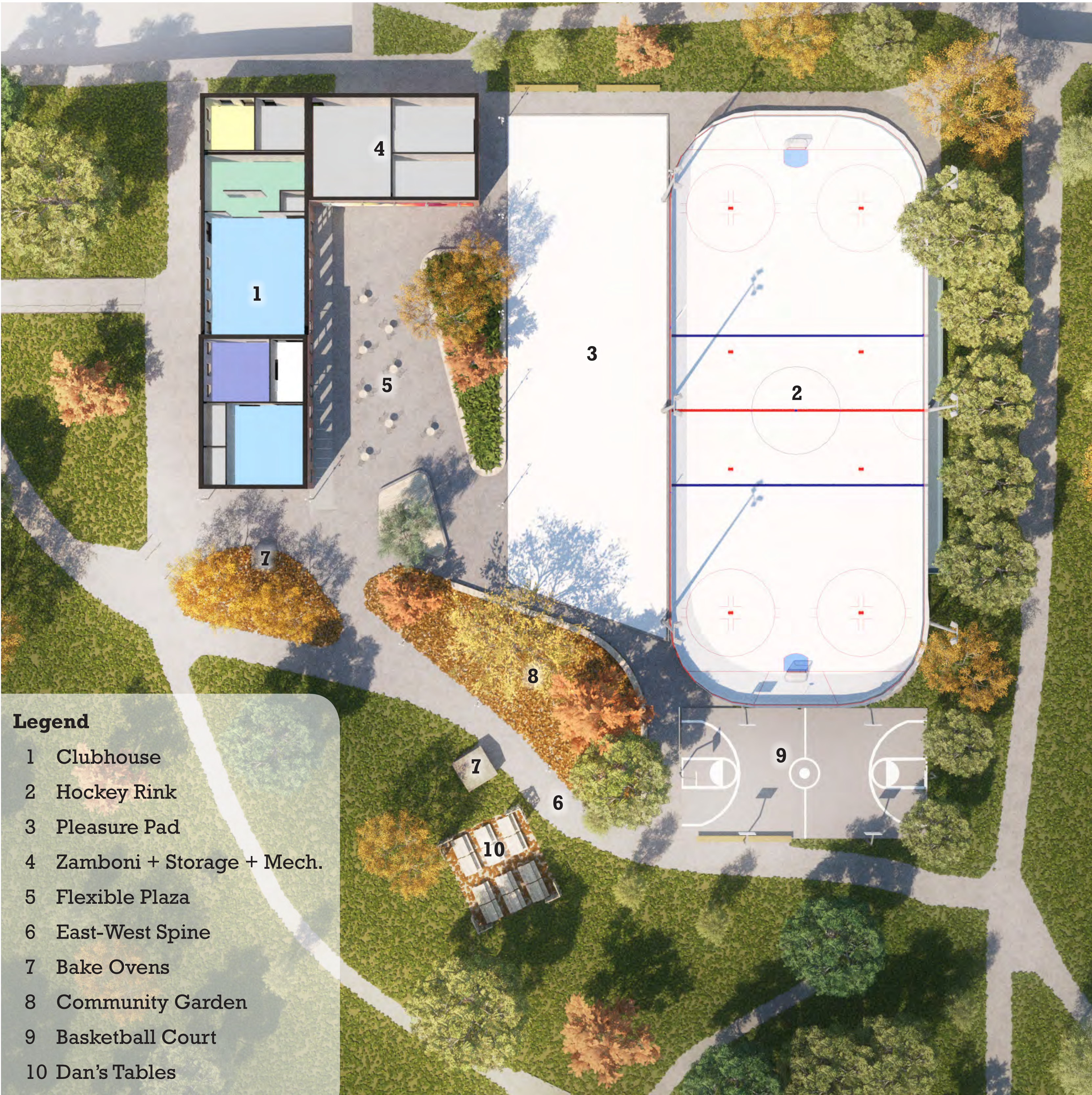
Option 3 Site Plan