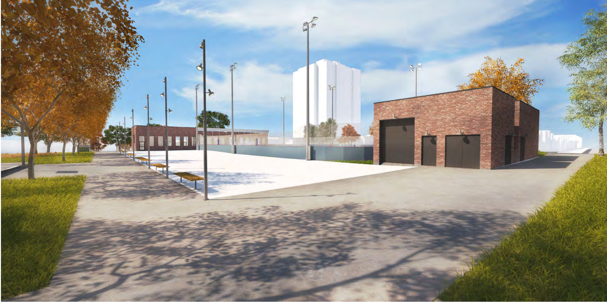
Option 2 view looking northwest