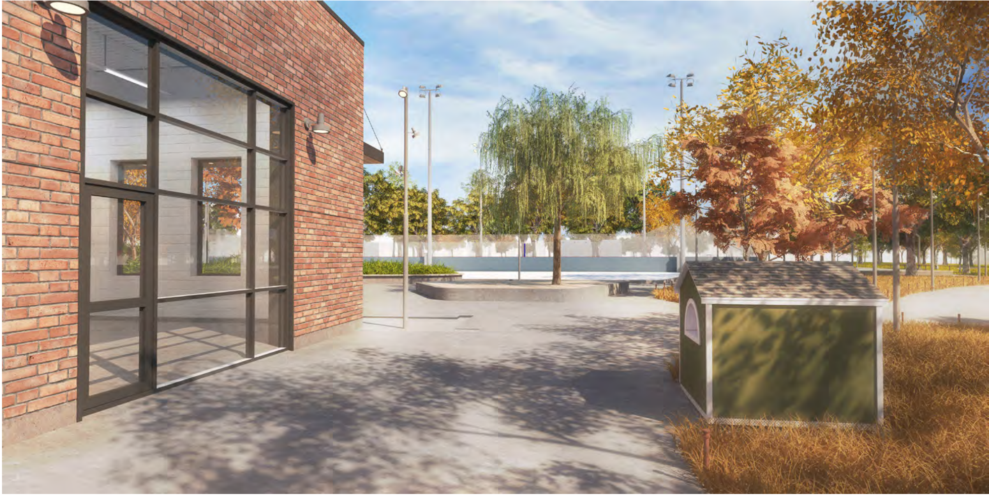
Option 3 view looking east