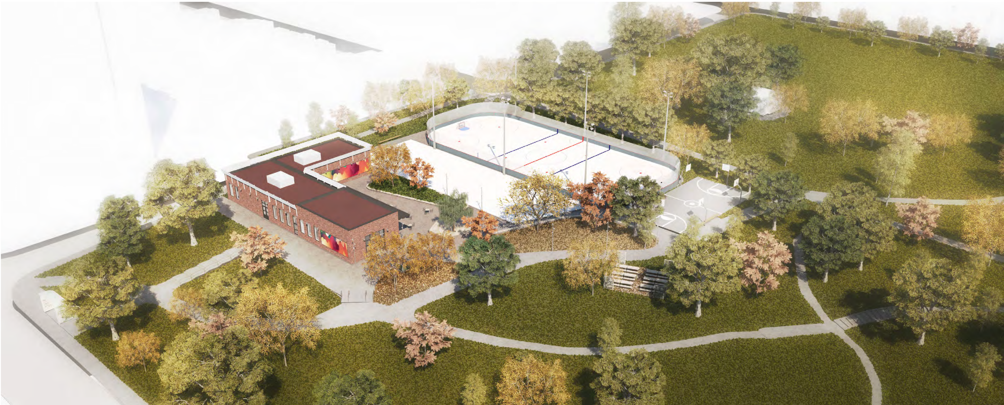
Option 3 Bird's Eye view from south looking northeast