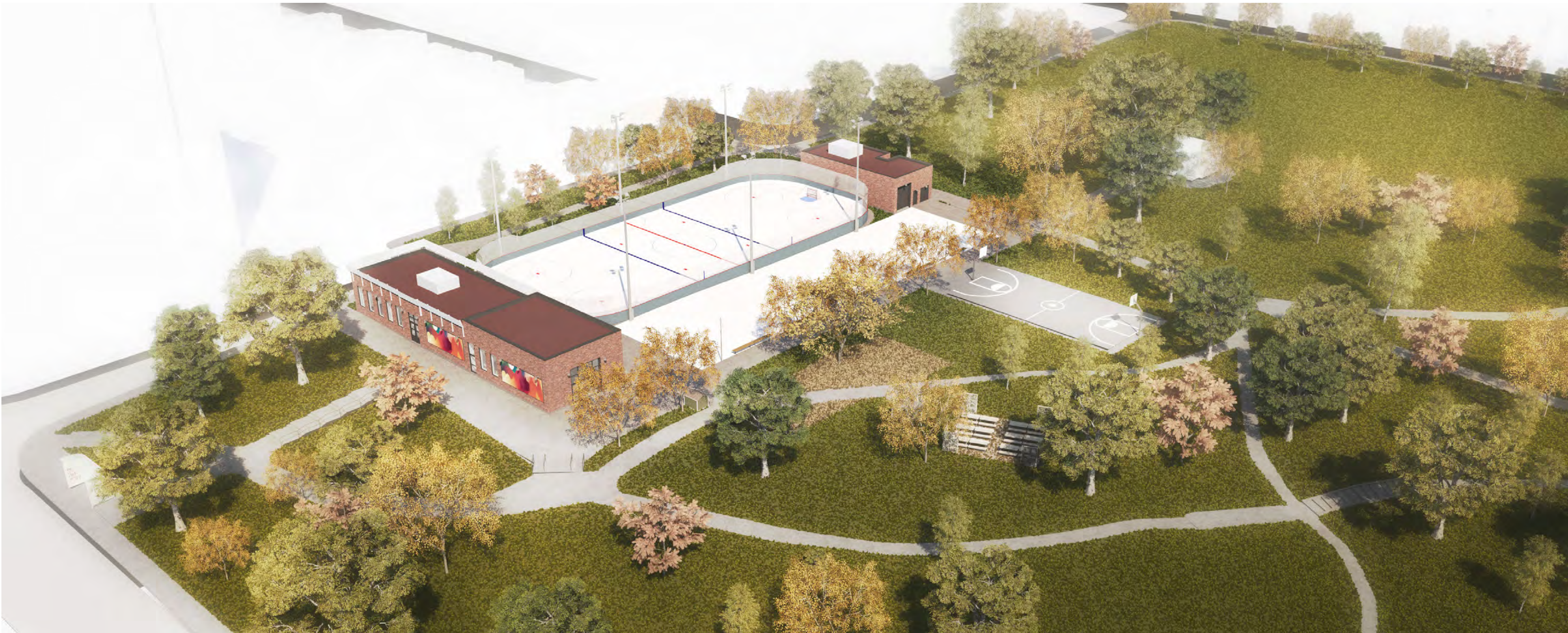
Option 2 Bird's Eye view from south looking northeast