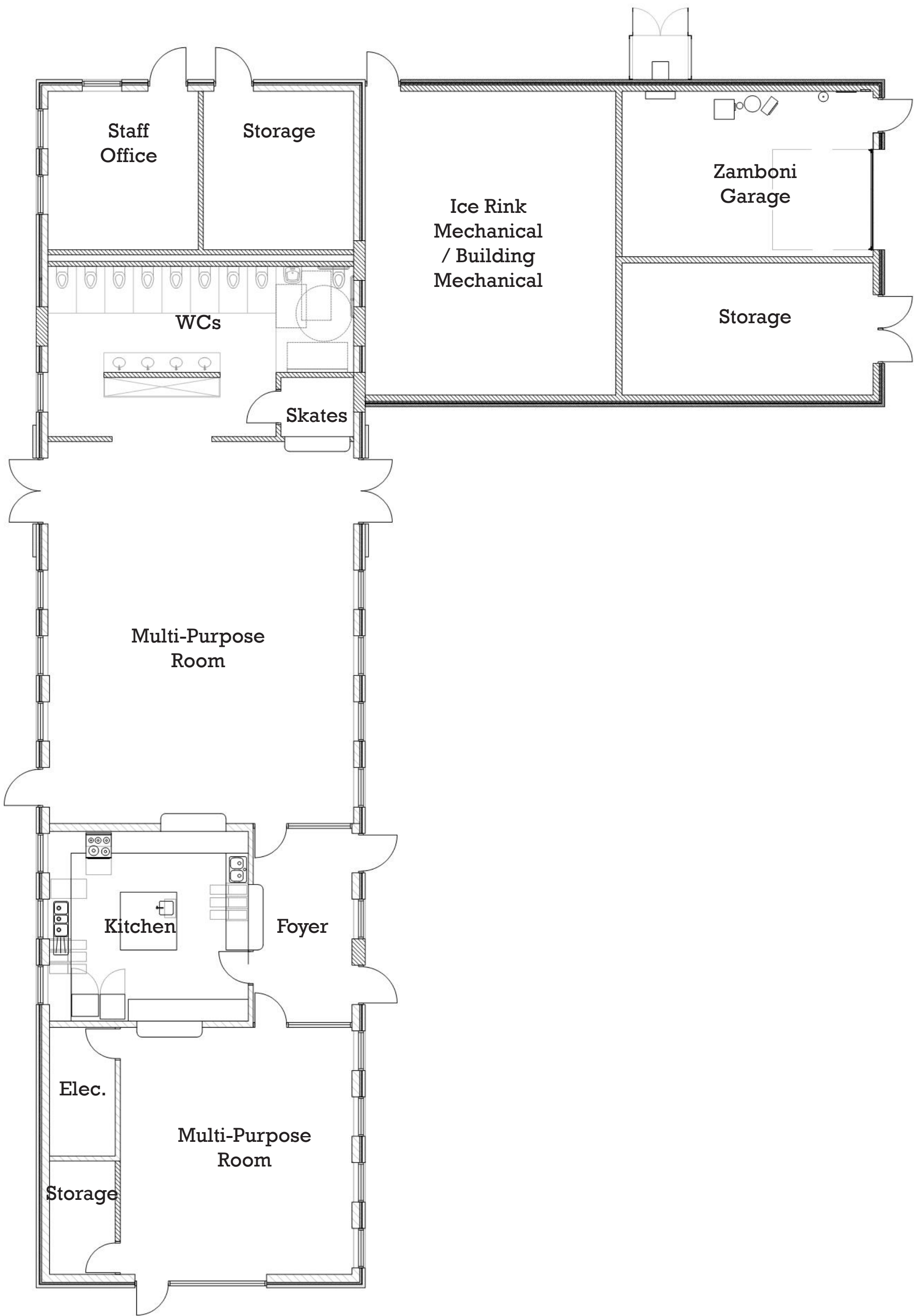
Option 3 Clubhouse + Rink Mechanical Addition Plan