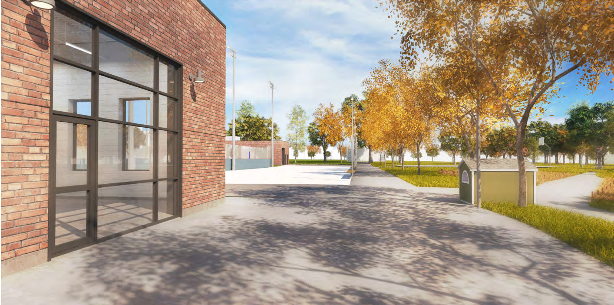
Option 2 view looking east