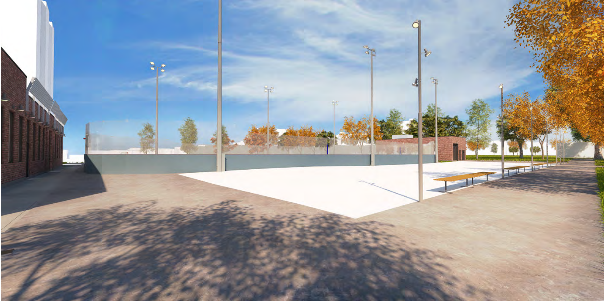
Option 2 view looking north