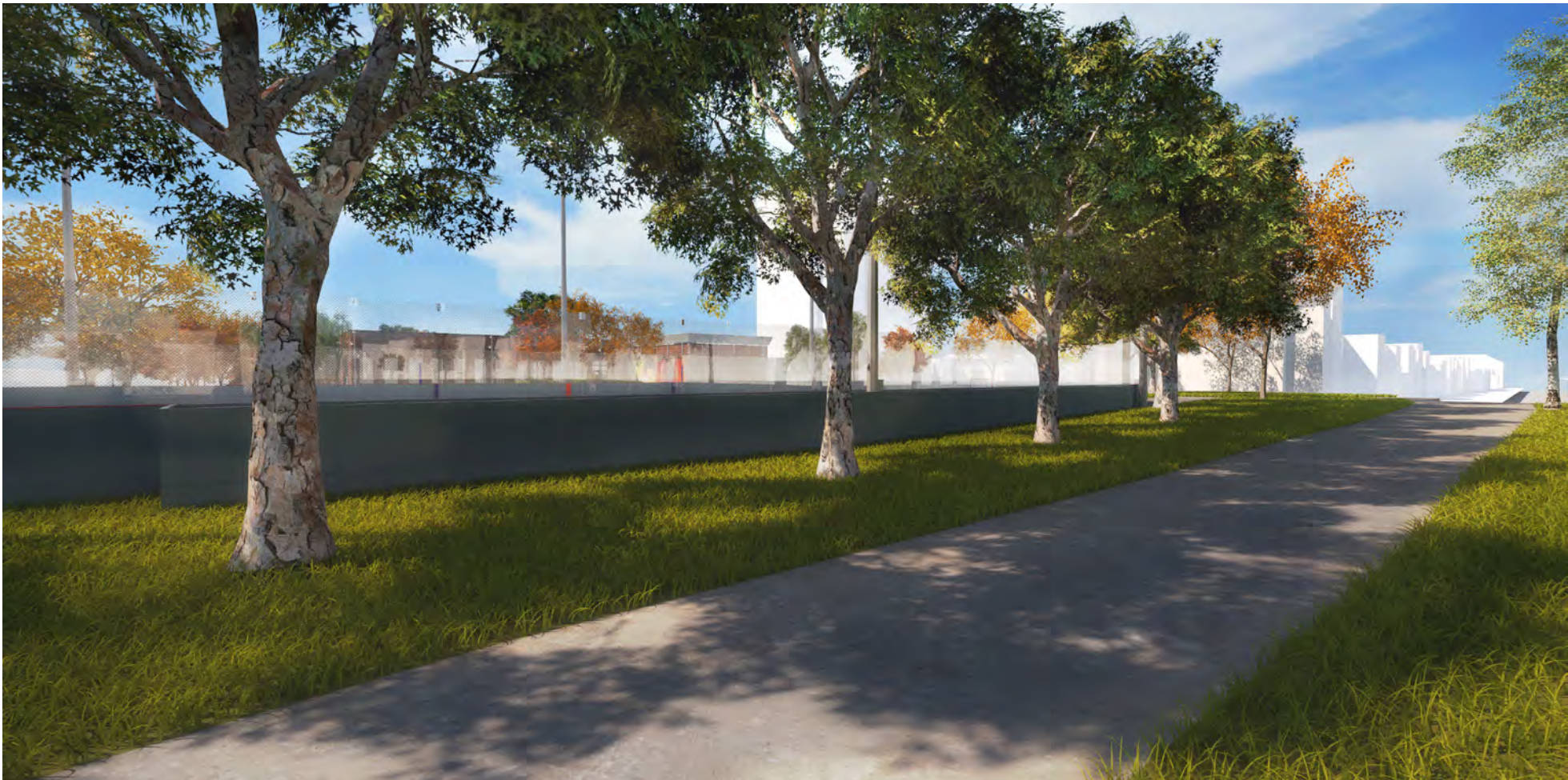
Option 3 view looking northwest