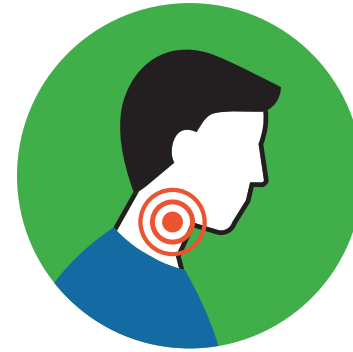
Sore throat, trouble swallowing