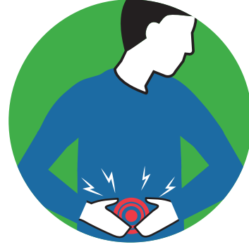
Nausea, vomiting, diarrhea