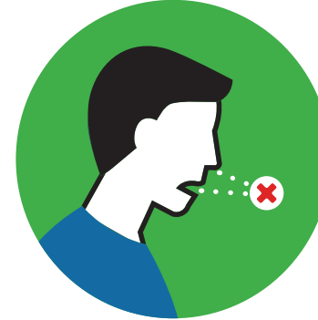
Loss of taste or smell