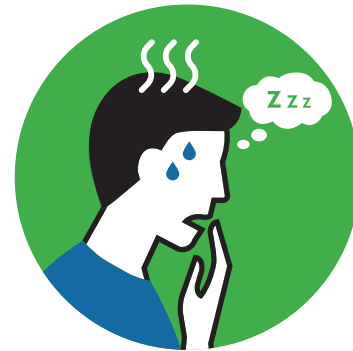
Not feeling well