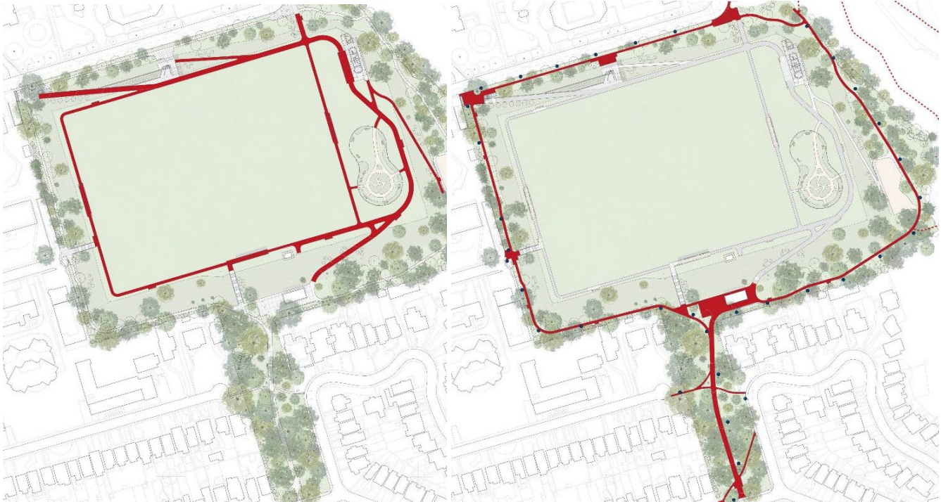
Left: Upper Perimeter Pathway and Service Road. Right: Lower Perimeter Pathway (red) and light poles (blue)