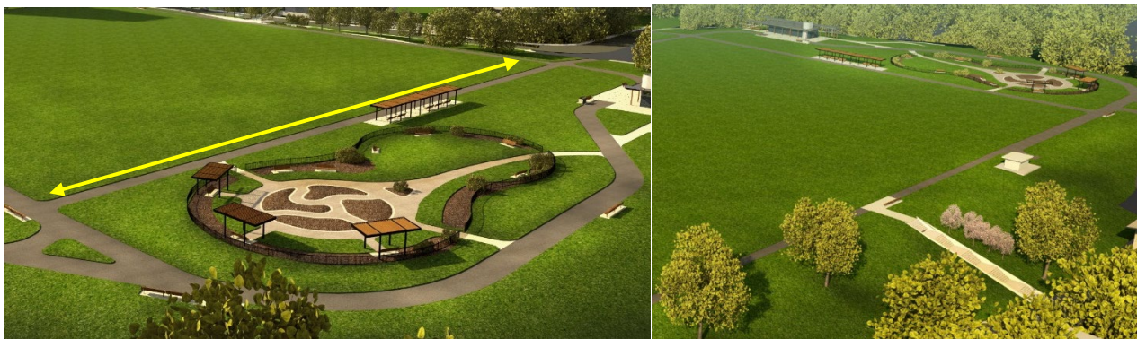
Left: The eastern segment of the Upper Perimeter Pathway widened to 3.0 metres