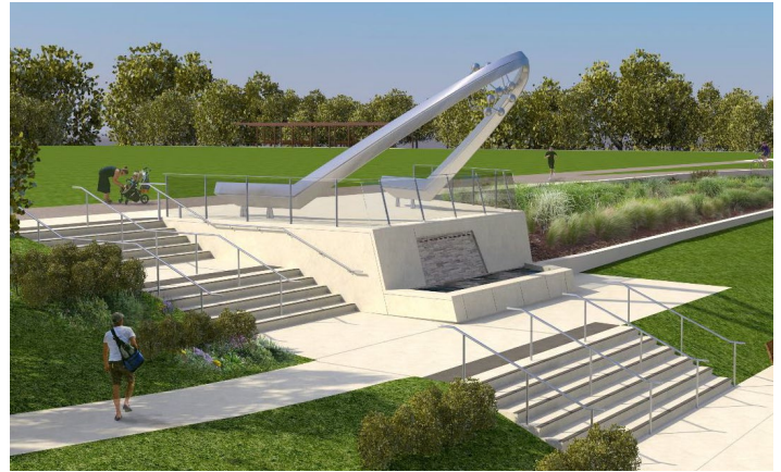
Centennial Monument and Water Feature on Rosehill Avenue