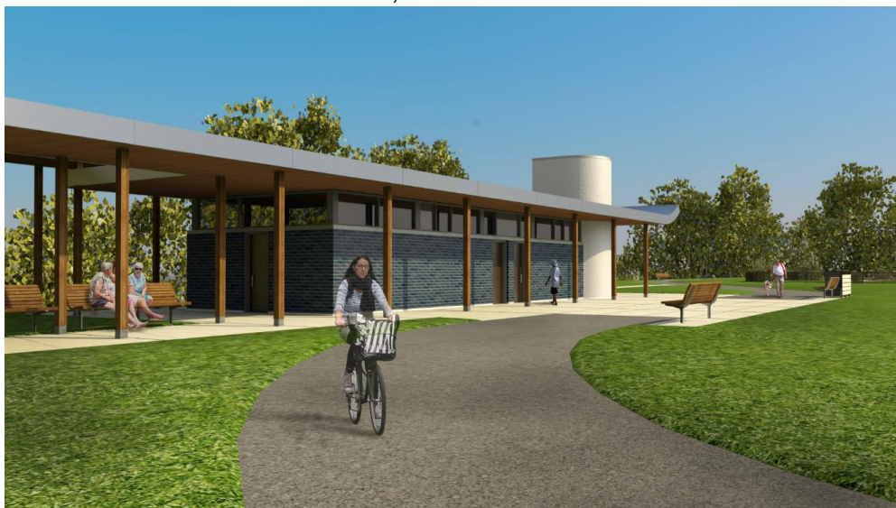
Service Road to the Washroom