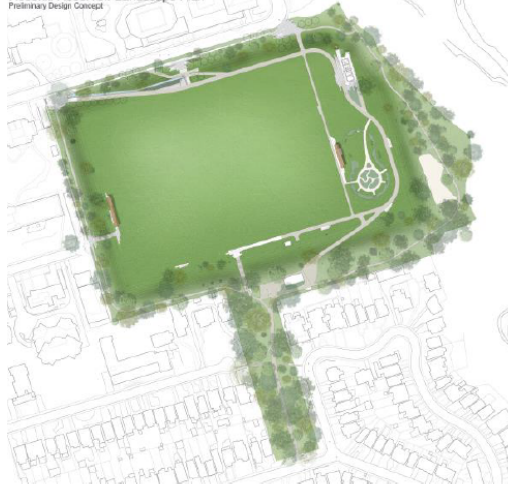
Preliminary overview Plan for David A Balfour Park Details may change after the printing of this notice.

Rosehill Reservoir Landscape Plan Preliminary Design Concept