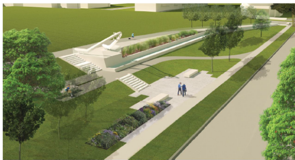
Illustration of Gateway and Water Feature (including Water Molecule) on Rosehill Avenue, looking west. Details may change after the printing of this notice.

Location: Christ Church Deer Park, 1570 Yonge Street, Elliot Hall