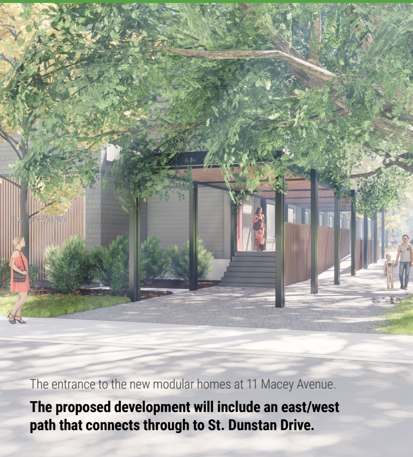
The entrance to the new modular homes at 11 Macey Avenue.

The proposed development will include an east/west path that connects through to St. Dunstan Drive.