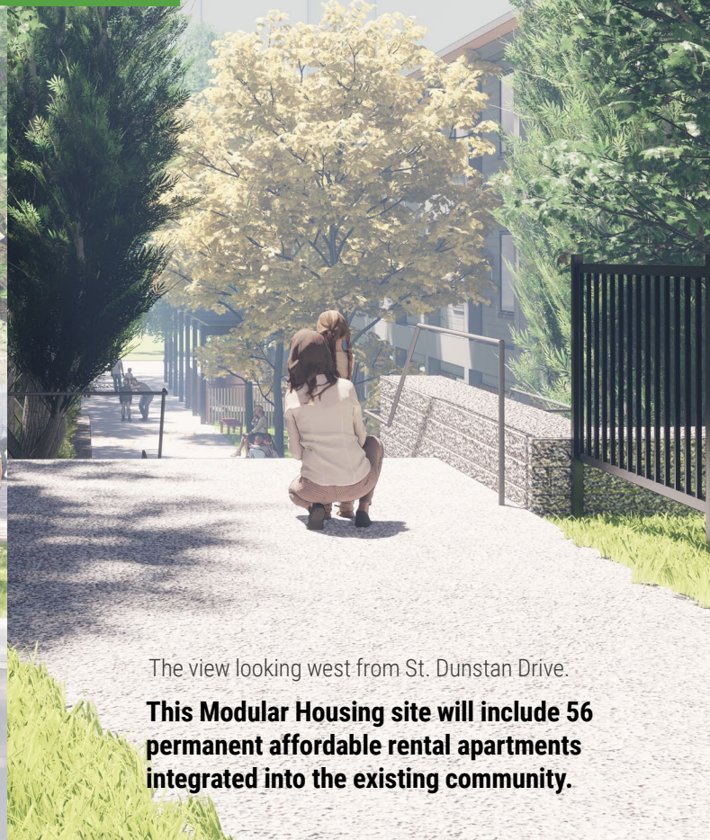
The view looking west from St. Dunstan Drive.

The proposed development will include an east/west path that connects through to St. Dunstan Drive.