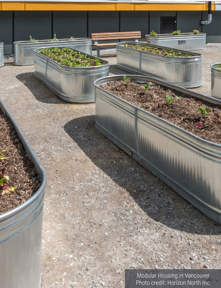
Modular Housing in Vancouver