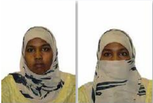
Acceptable —Head covering for religious beliefs or medical reasons while showing full facial features