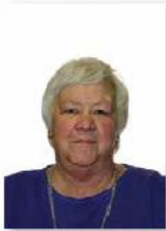
Acceptable—Contrast between clothes, background and face