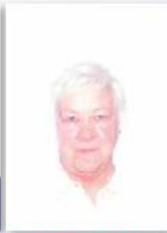
Unacceptable—No contrast between clothes, background and face