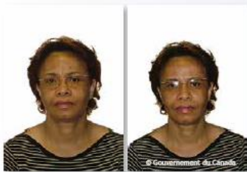
Acceptable No reflection or glare on glasses