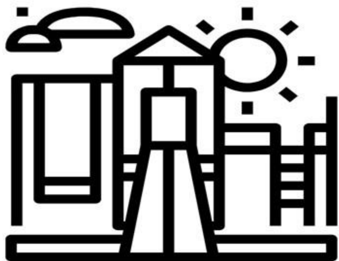
LARGE PLAY STRUCTURE

You can cut and paste the following features into your design to get you started, or draw your design by hand.