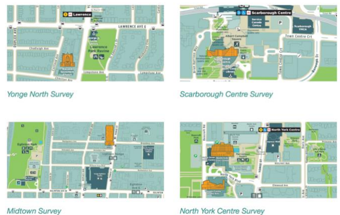
Figure 3: Screenshot of the survey website

The TO360 Local Mapping Consultation will be live until Friday, March 29, 2019.